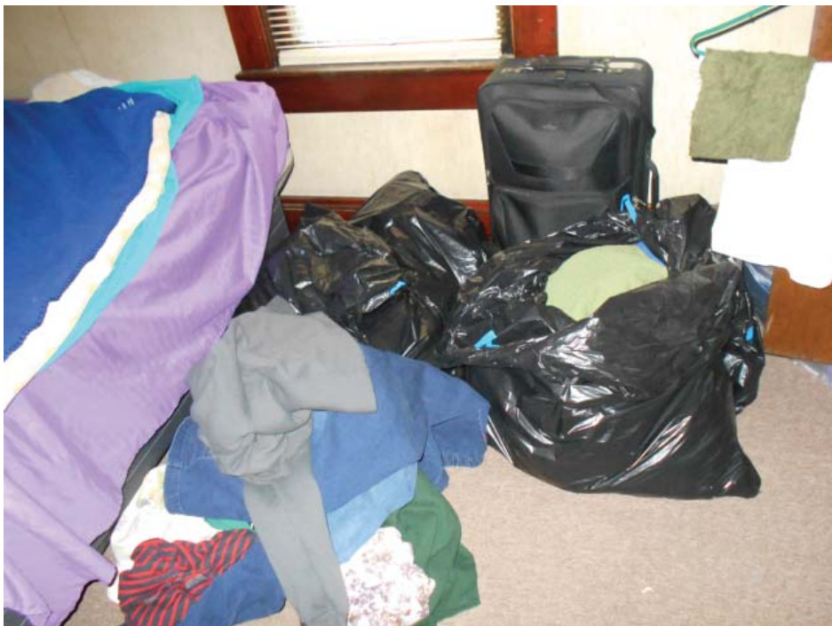
Photo 23 - Not enough furniture to put away belongings