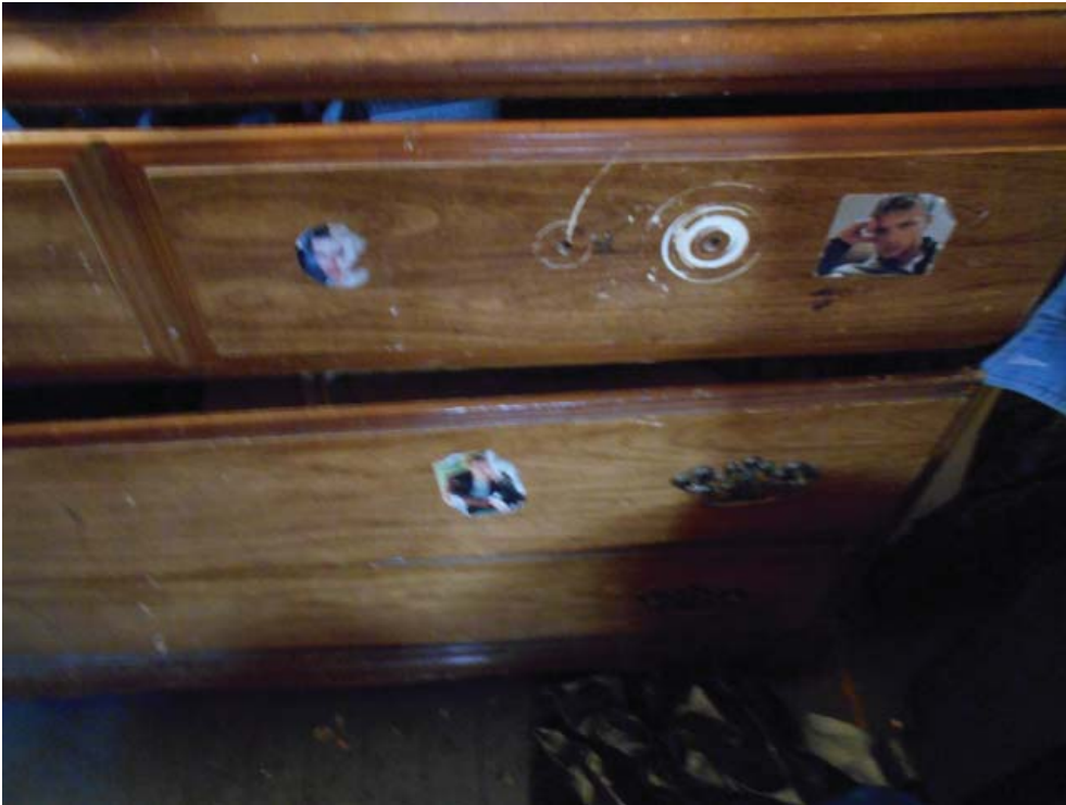
Photo 52 - Broken furniture