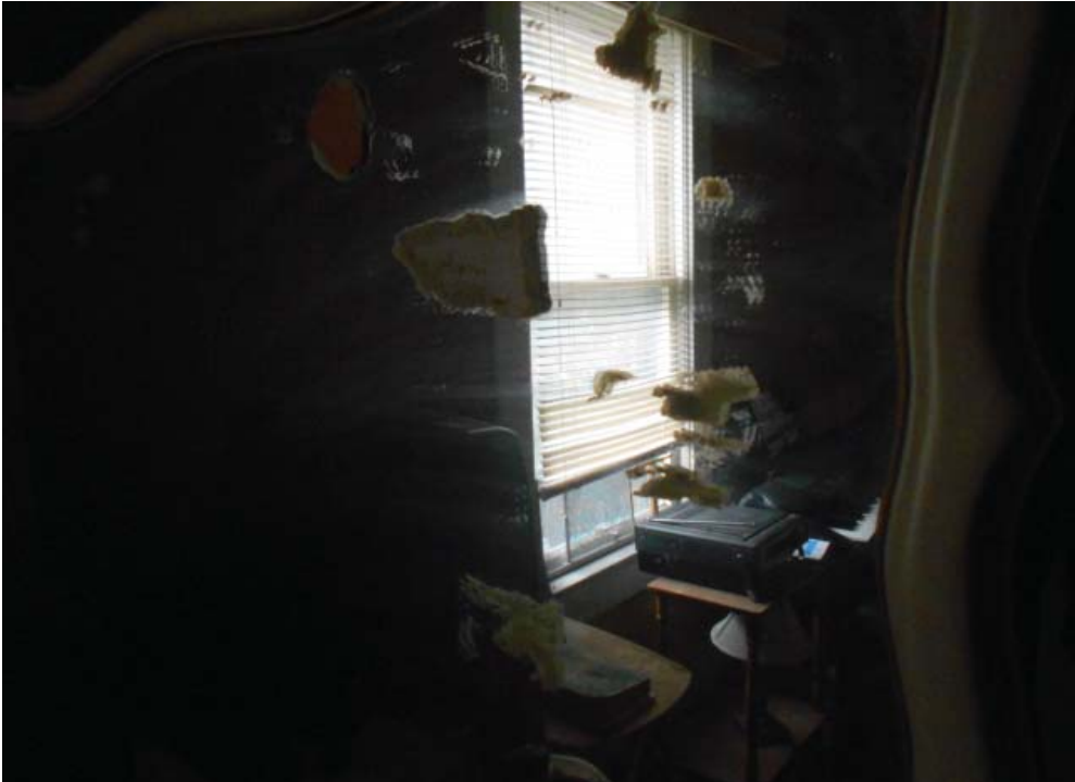
Photo 18 - Mirror-objects stuck on mirror-dirty