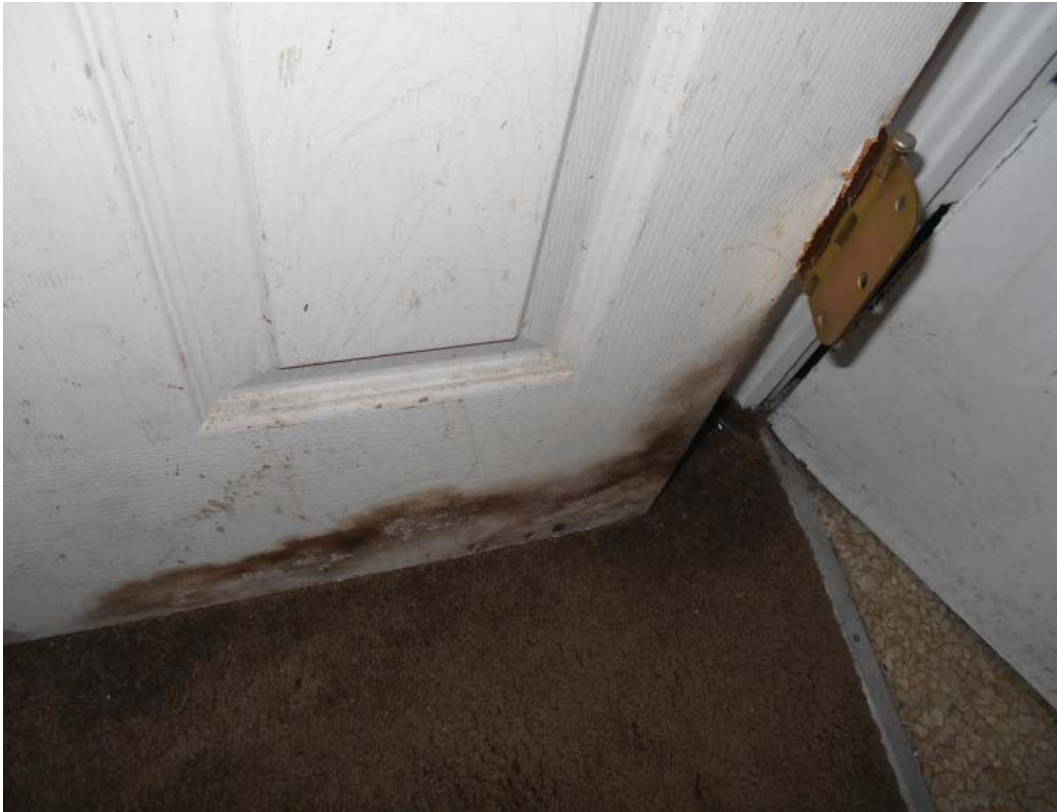
Photo 98 - Broken door with stained/black matter