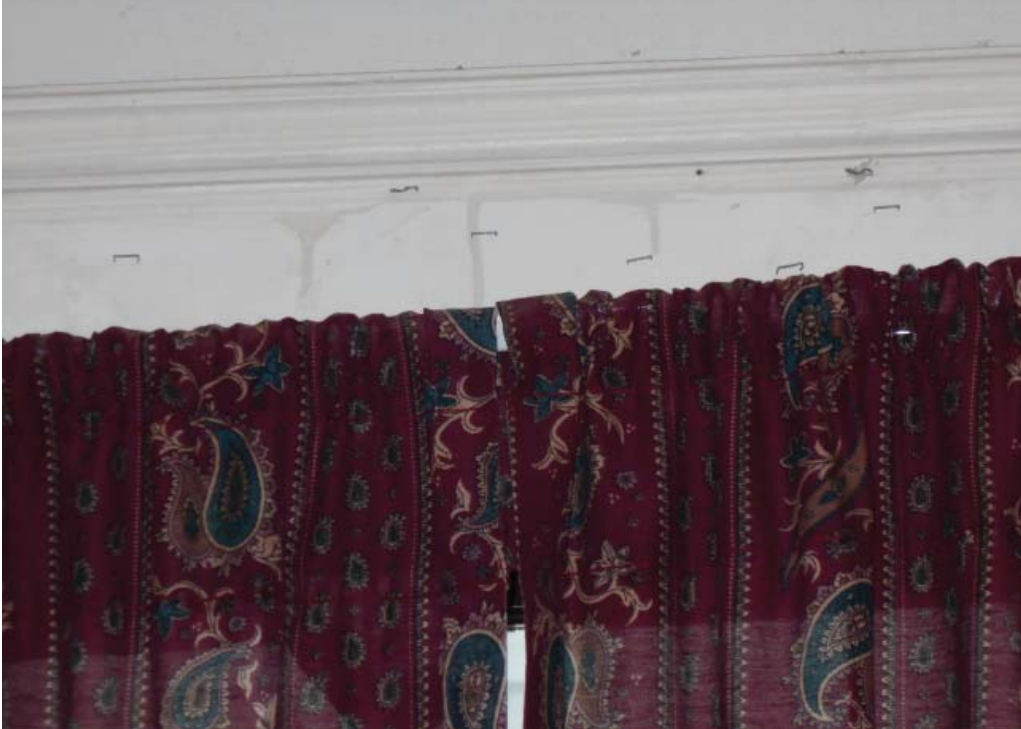
Photo 101 - Staples in wood above drapes