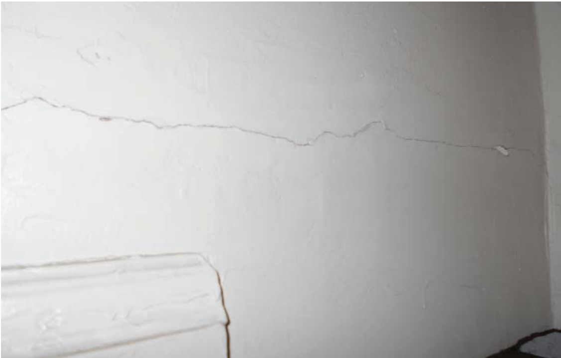
Photo 71 - Crack in wall