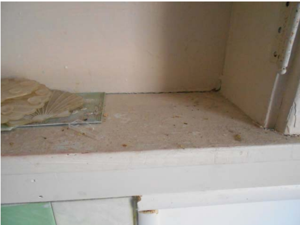
Photo 83 - Bathroom cabinet-dirty