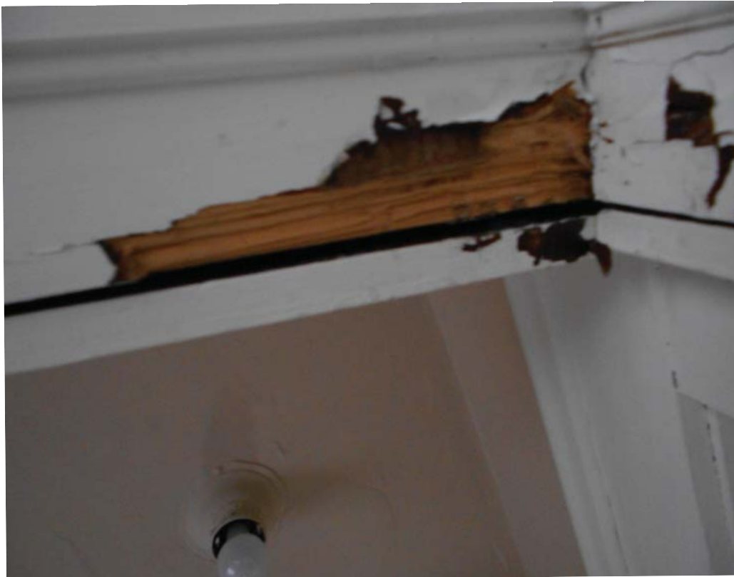
Photo 86 - Door frame broken