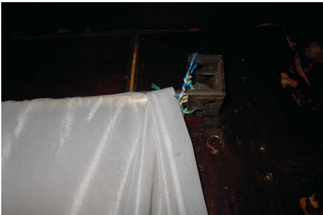
Photo 6 - Curtain hung with zip-tie, curtain holder is broken