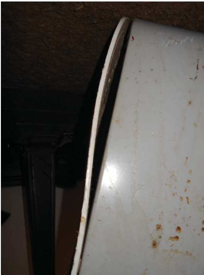
Photo 91 - Fan with side broken and stained