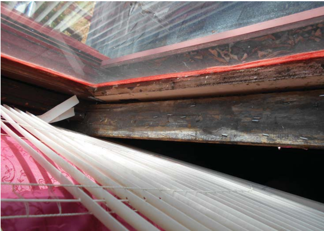
Photo 93- Window sill covered in dirt and staples