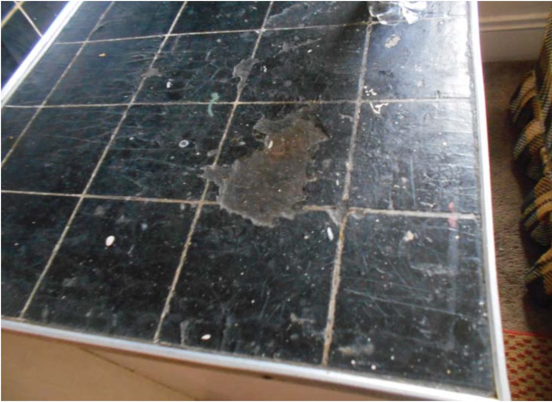
Photo 100- Cracked/hole in counter top in common area