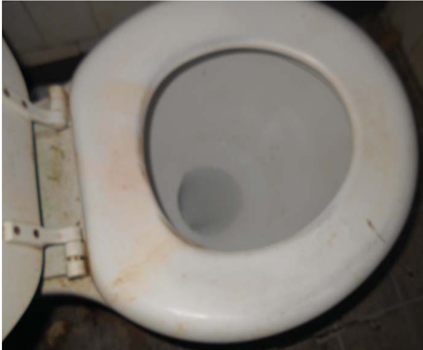
Photo 38 - Stained/ filthy/dirty toilet