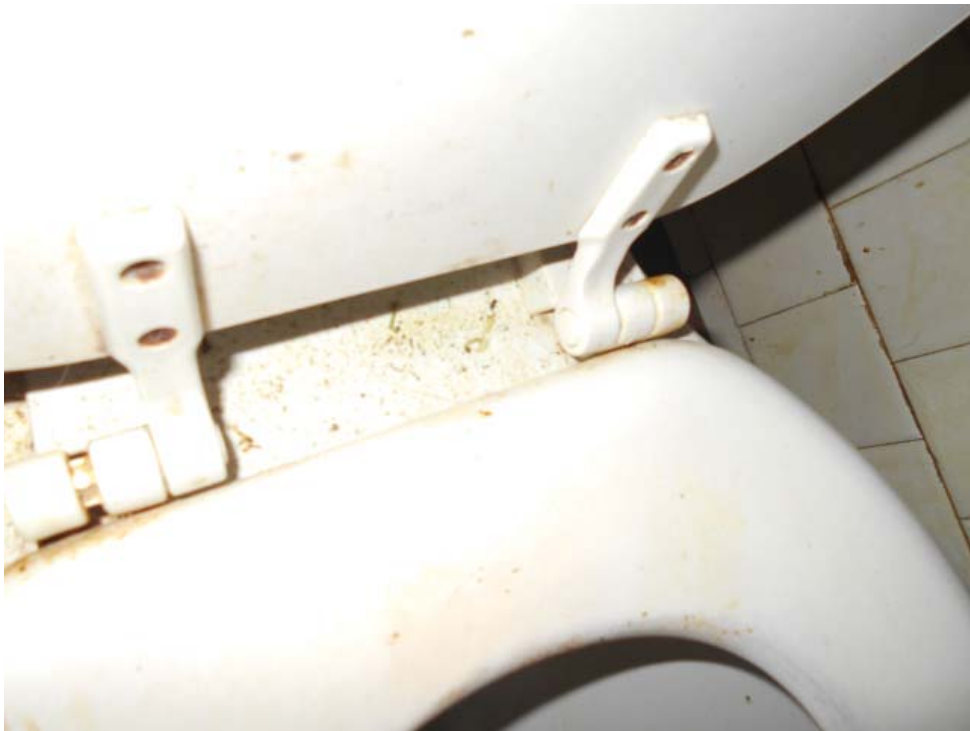
Photo 39 - Another photo of toilet-stains on wall