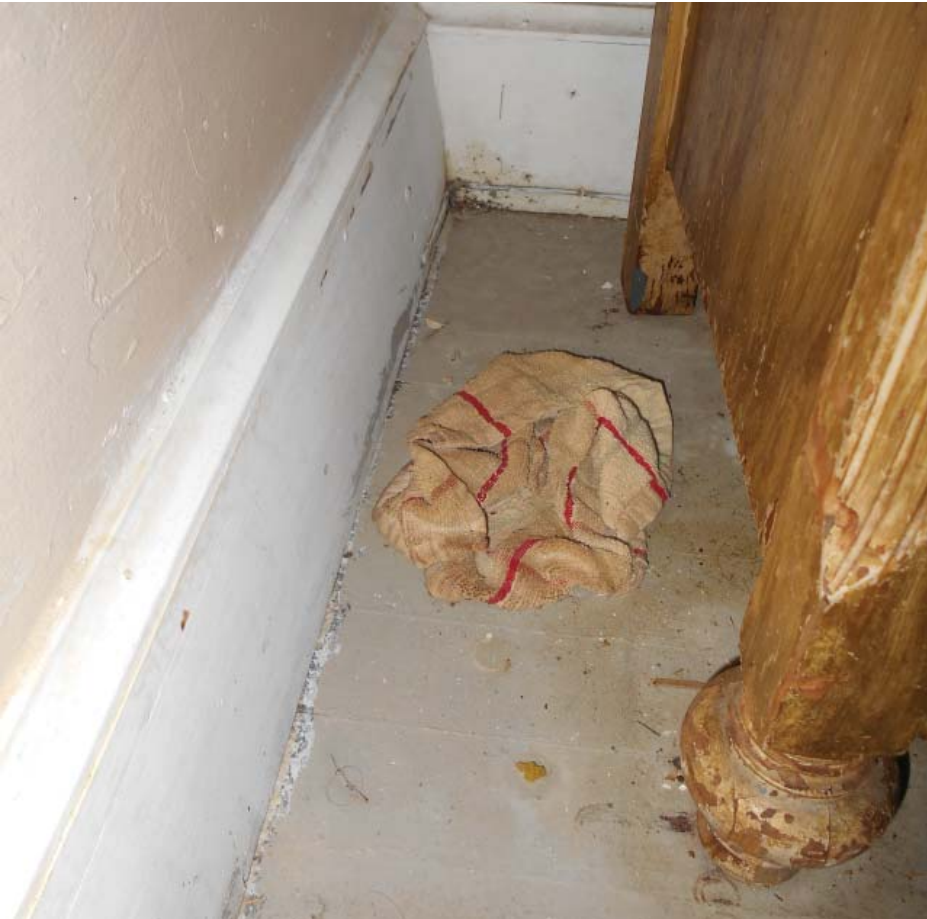
Photo 59 - Dirty/ stained floors with stained rag next to marred/stained/ broken furniture