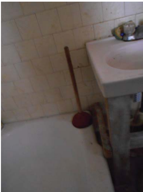
Photo 45 - Bathtub with plunger on the side-sanitary issues