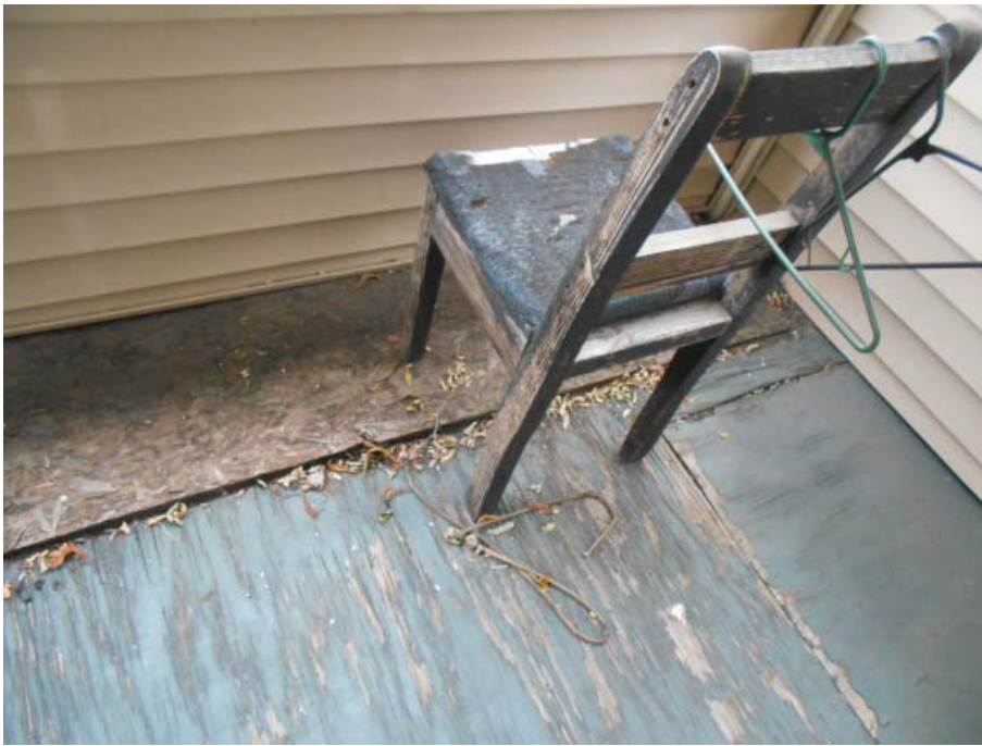
Photo 28 - Second floor porch that is accessible and used by residents- broken floorboards, broken/dirty chair