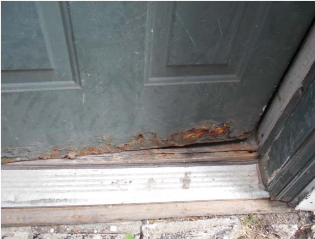
Photo 76 - Rusted door with hole