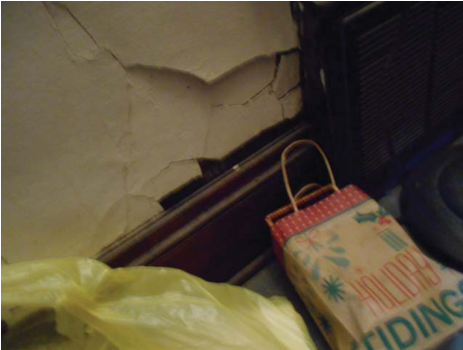
Photo 49 - Hole in the wall