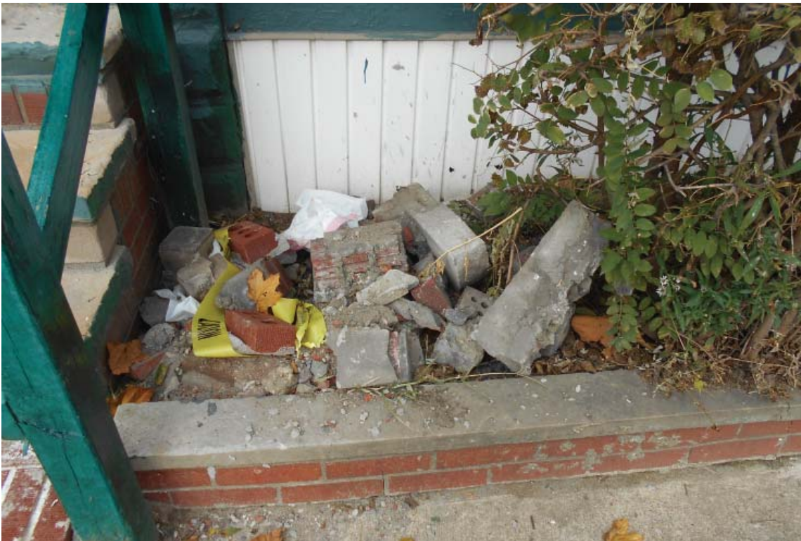
Photo 3 - Large cement blocks/bricks discarded by entry steps mixed with litter