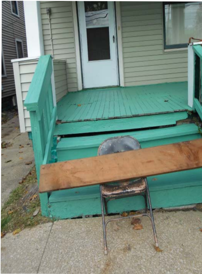
Photo 54 - Broken front porch stairs that are blocked with a chair and a board