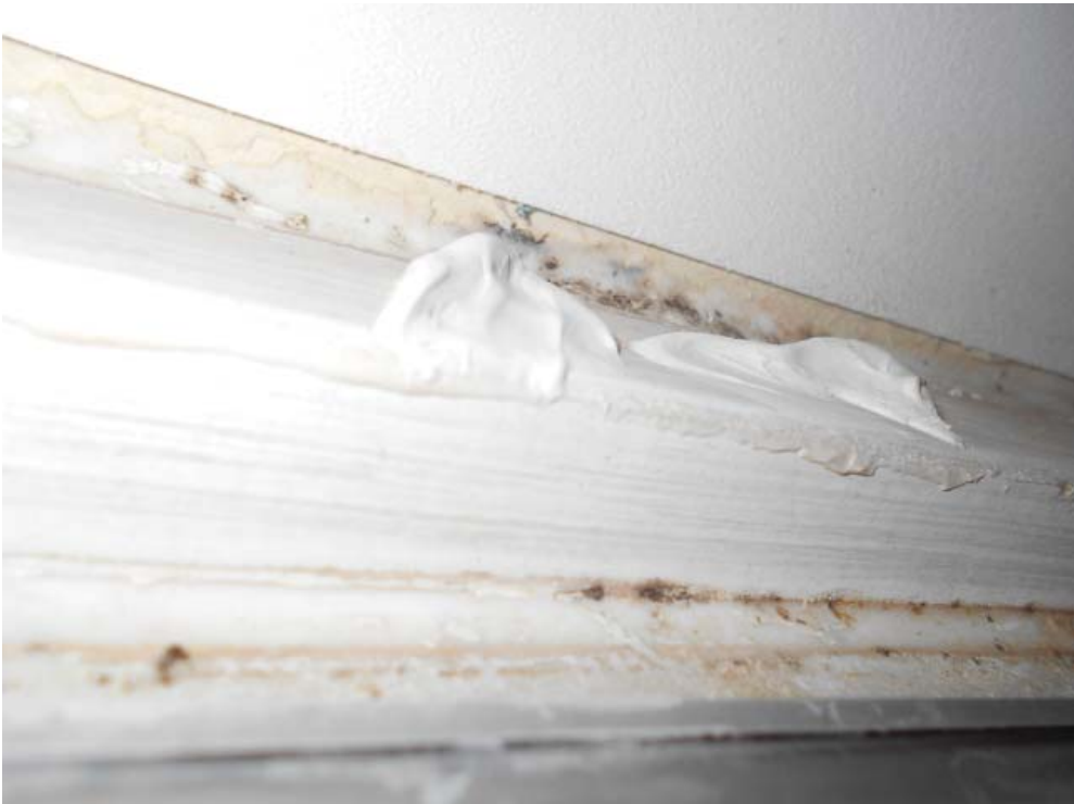
Photo 69 - Bathtub black/brown/yellow unidentified matter