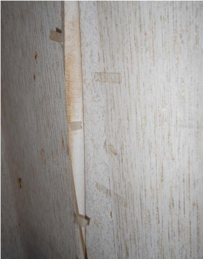
Photo 26 - Ripped wallpaper-stained-held together by tape