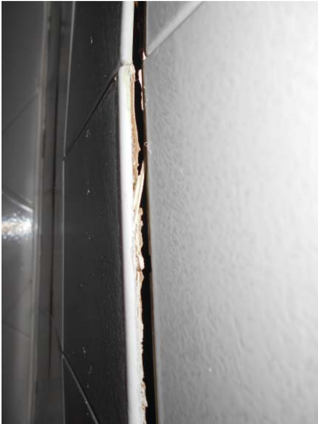
Photo 66 - Bathroom tile pulling off of the wall