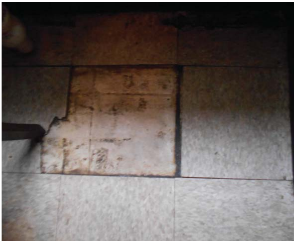
Photo 9 - Missing/ filthy tile