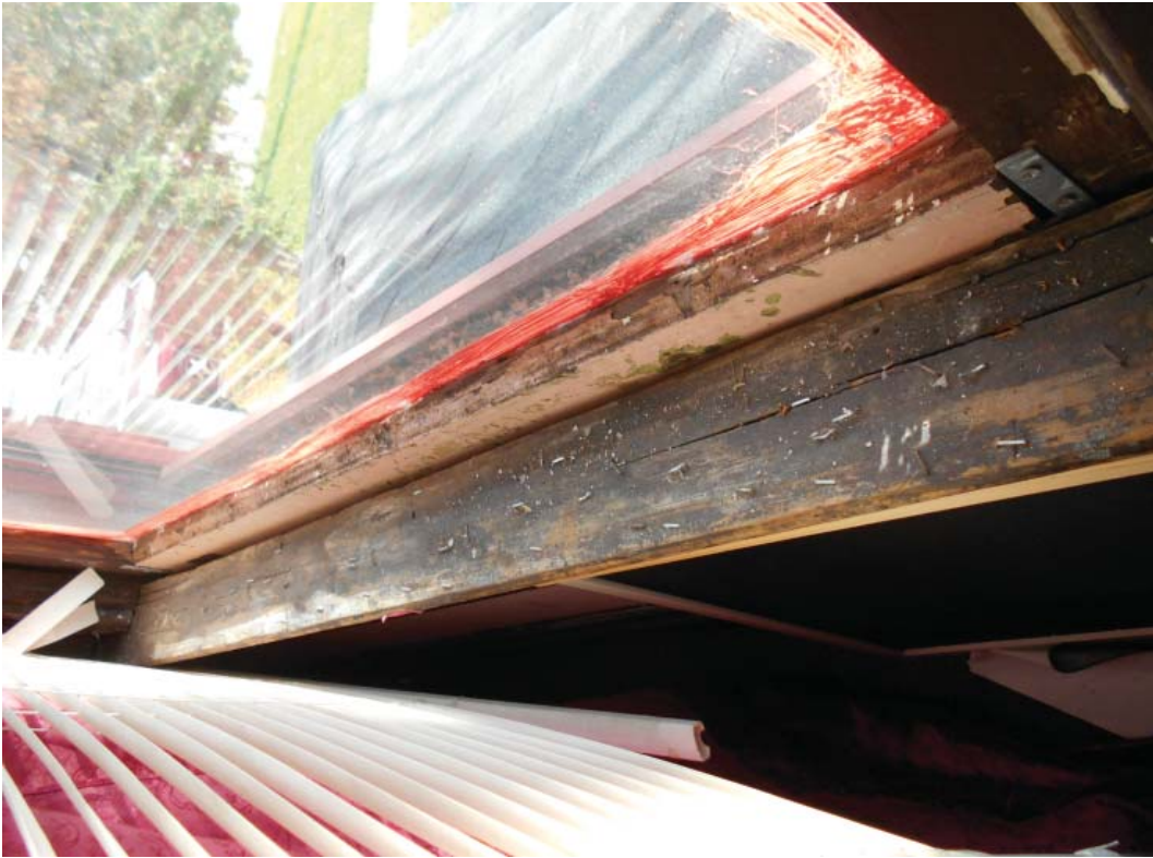
Photo 94 - Another view of broken window sill covered in staples