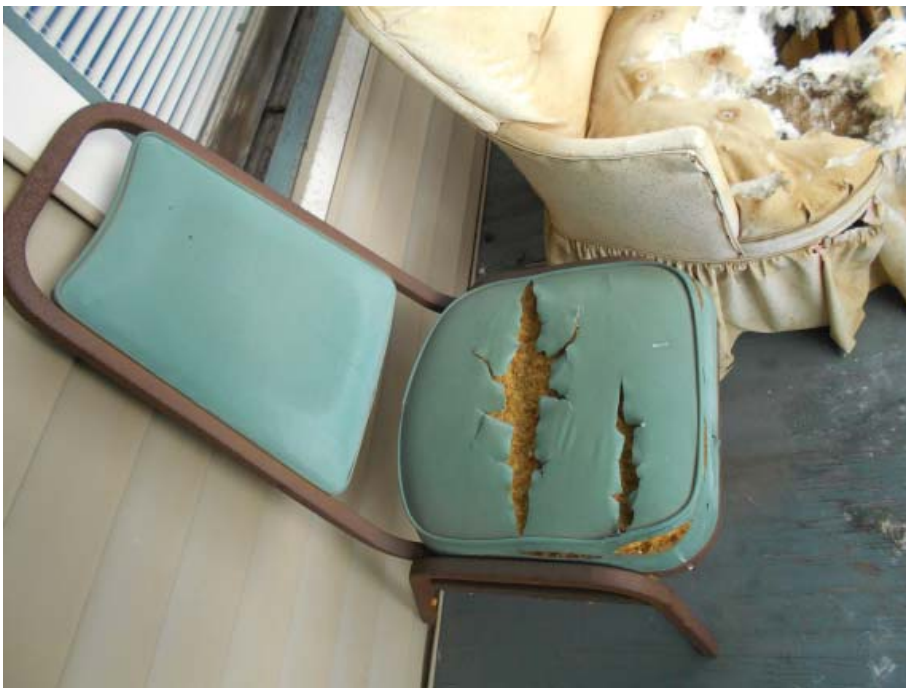
Photo 29 - Ripped/rusted chair on second floor porch