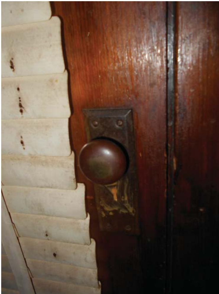
Photo 34 - Door with stained/dirty blinds and dirty door