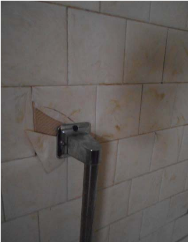
Photo 46 - Broken tile