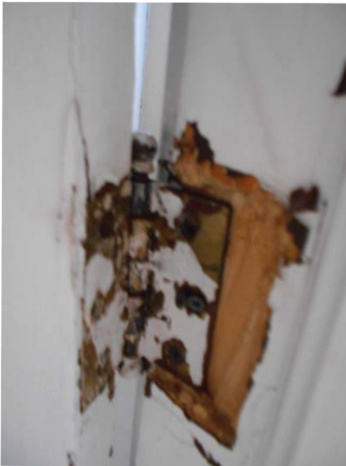
Photo 84- Door hinge-broken- rusted