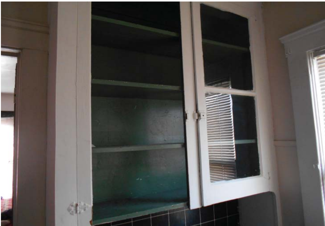
Photo 99 - Broken cabinet in common area missing glass