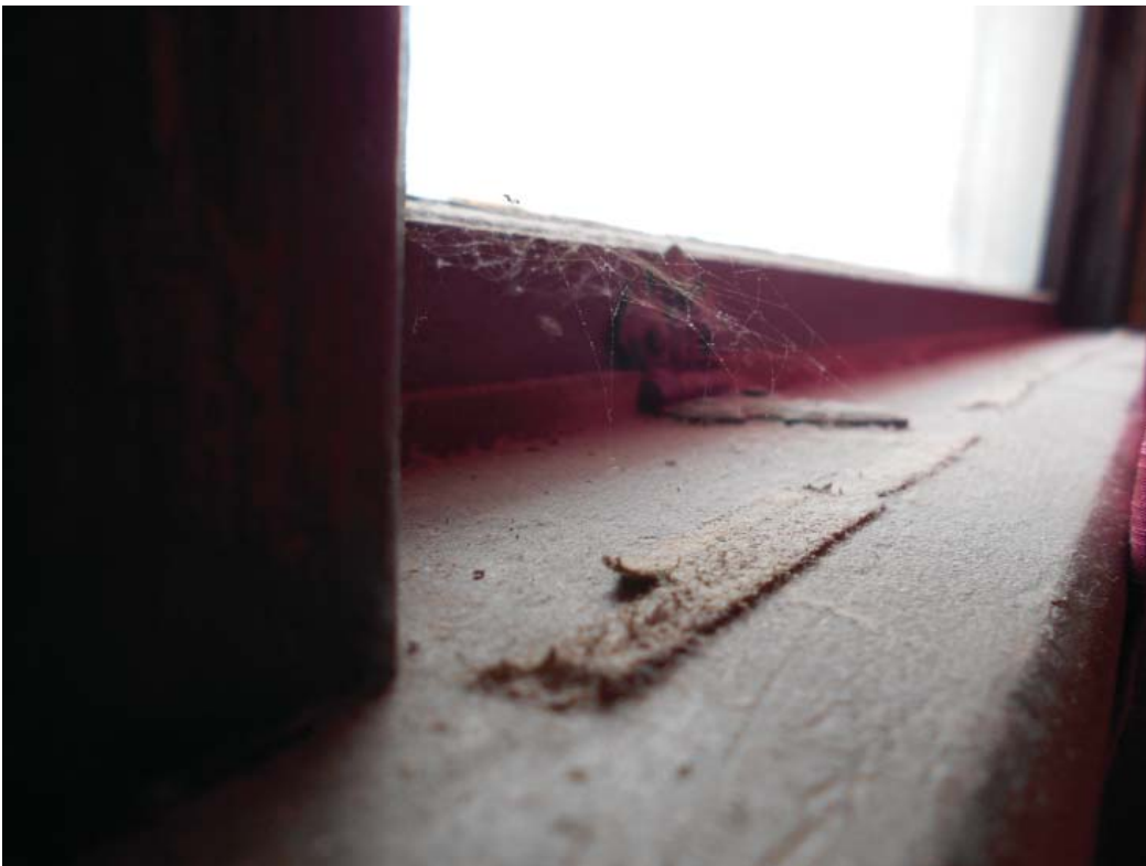
Photo 95 - Window sill covered/caked in dust