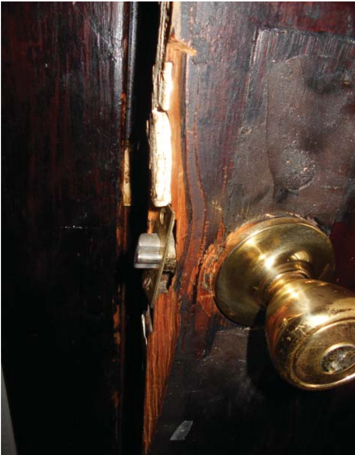
Photo 47 - Broken door