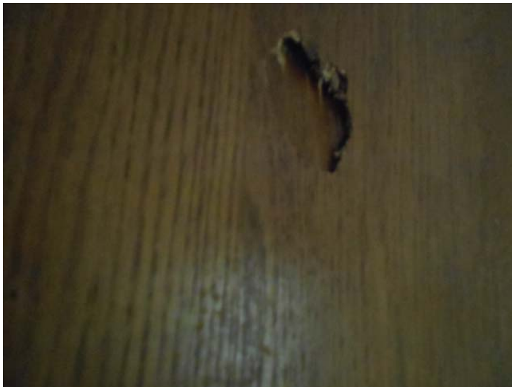
Photo 57- Hole in wall