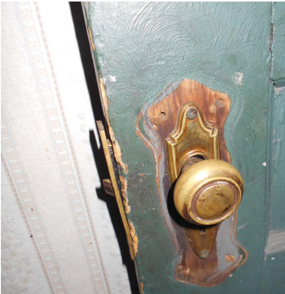
Photo 11 - Door missing hardware- broken door frame-