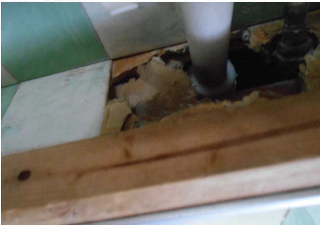
Photo 85- Under bathroom sink-hole-unknown matter