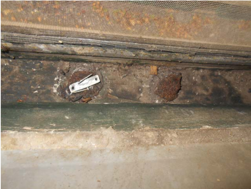
Photo 58 - Window sill-dirty/hardware/cigarette butts/screen peeling/caked unknown black matter and rust covered objects