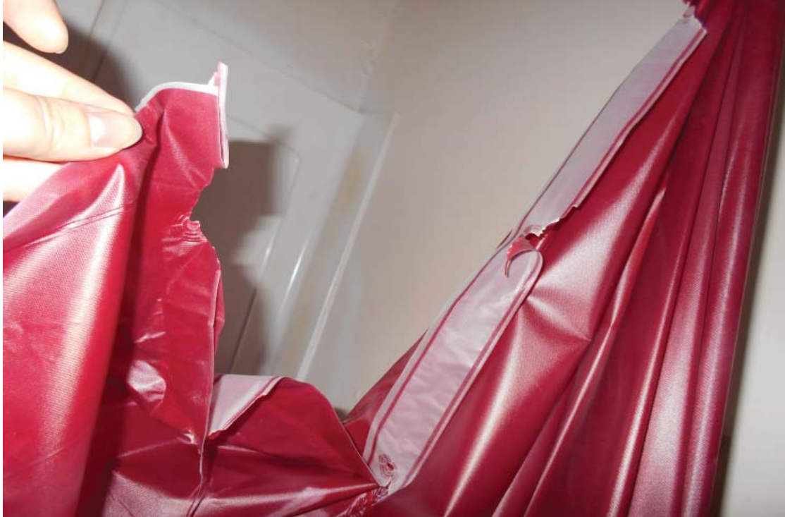
Photo 81 - Shower curtain that is ripped and not on a rod