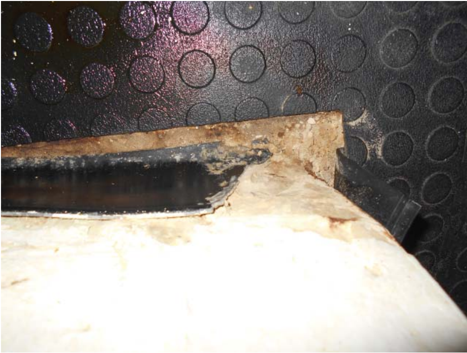
Photo 64 - Bathtub molding peeling -missing-black/brown unidentified matter