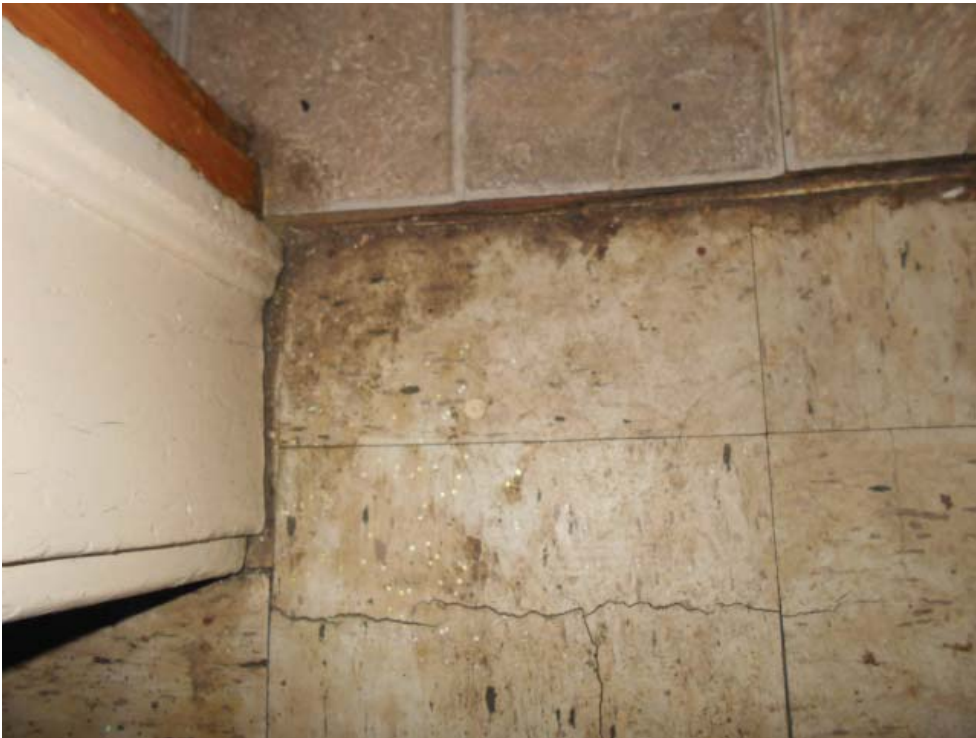
Photo 37 - Floor tile cracked-covered in unknown black matter and dirt