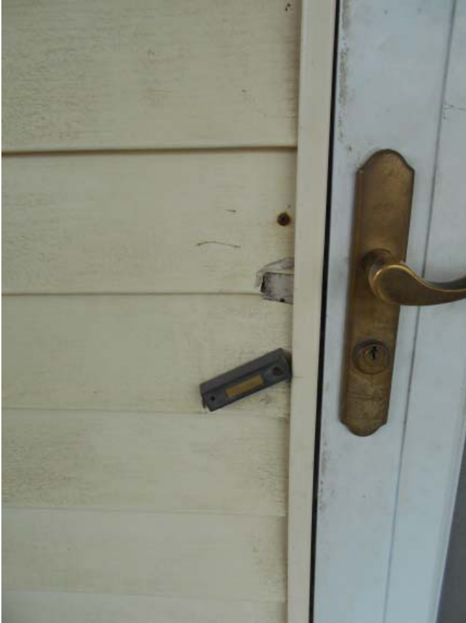
Photo 2 -Doorbell broken