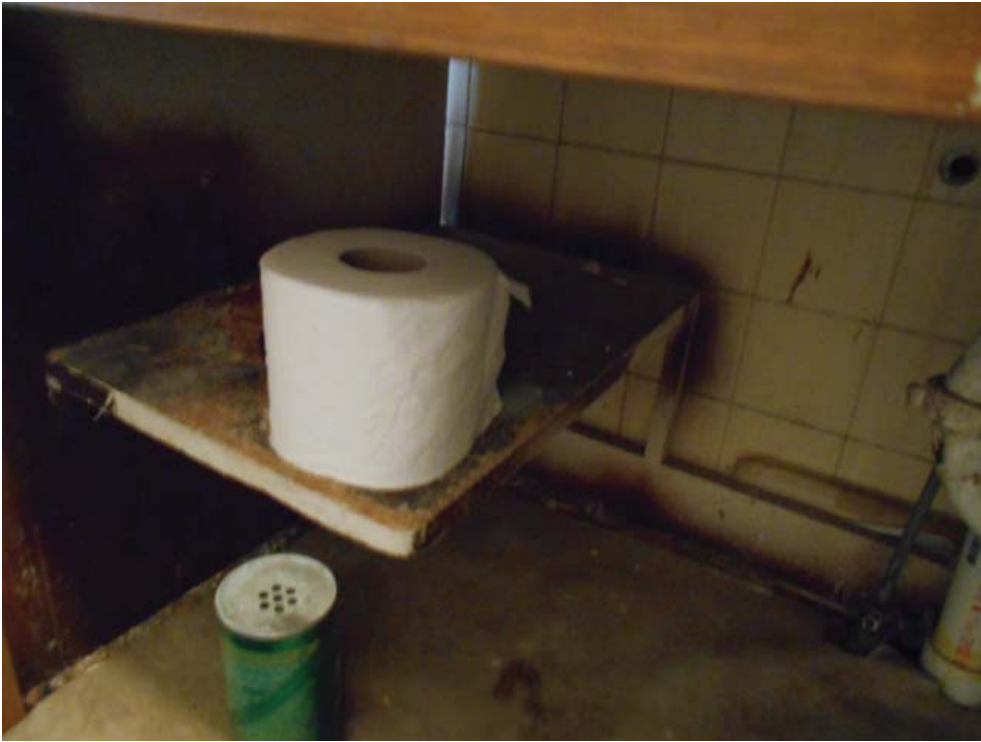
Photo 62 - Bathroom sink with toilet paper (not wrapped) on top on filthy shelf covered with black/brown/orange matter/stains