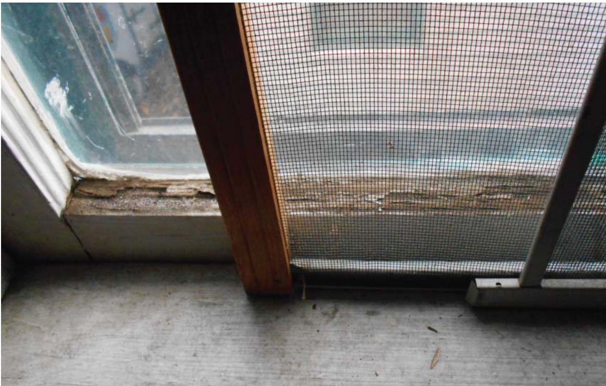
Photo 17 - Broken/dirty window frame