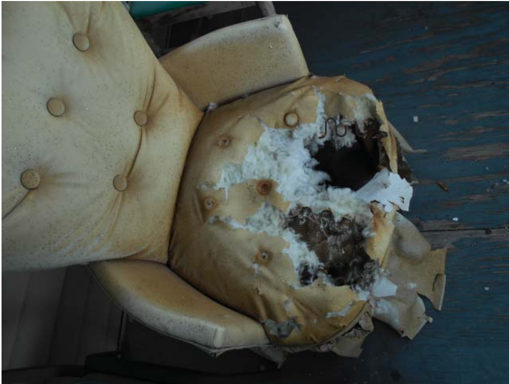
Photo 30 - Ripped-broken chair with exposed springs-unsafe