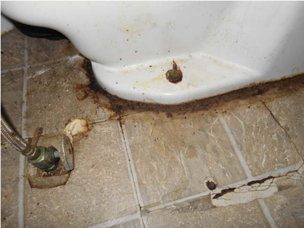
Photo 40 - Bathroom floor around toilet-stained/dirt/cracked in tiles/unknown particles and substance