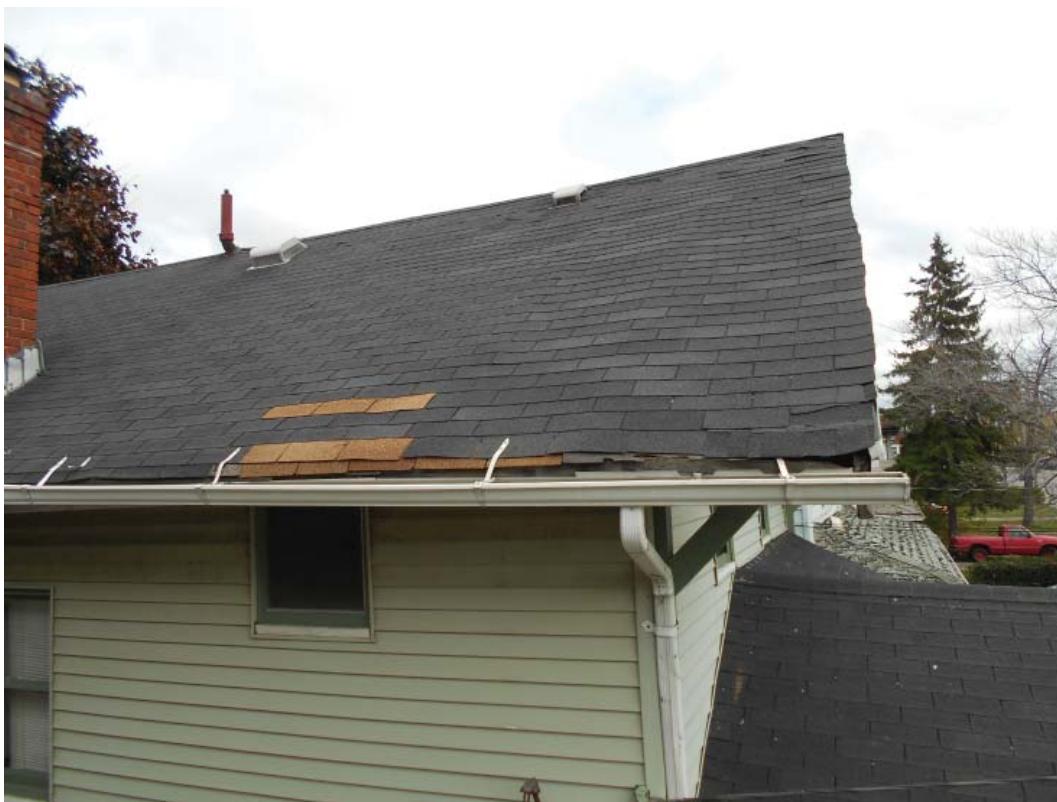
Photo 32 - Shingles lifting up from roof