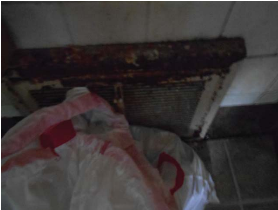
Photo 41 - Bathroom vent-rusted, dirty, and covered in black unknown matter