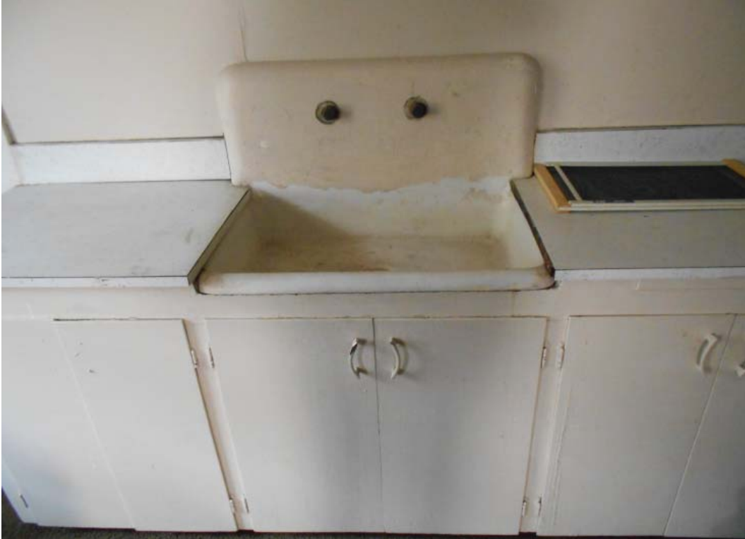
Photo 97- Unused sink in common area-dirty