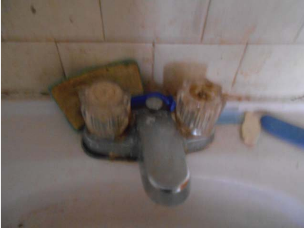
Photo 43 - Rusty/dirty bathroom sink that is stained/with orange/yellow stains