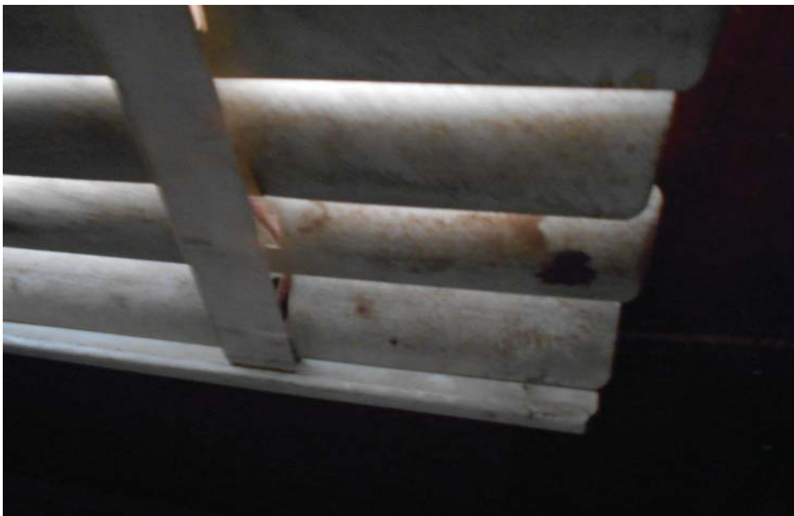
Photo 35 - Dirty/stained blinds