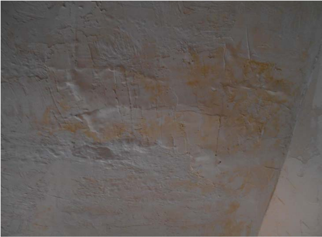
Photo 102- Staining on ceiling with cracks