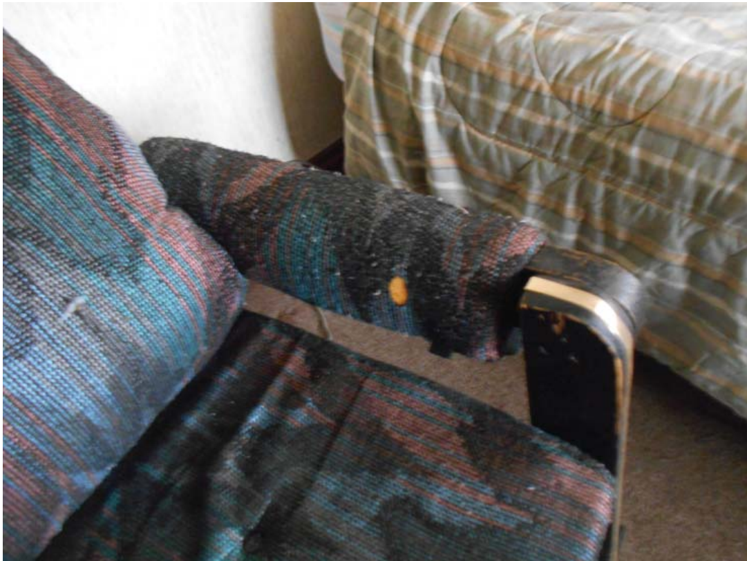
Photo 25 - Ripped/broken/dirty furniture