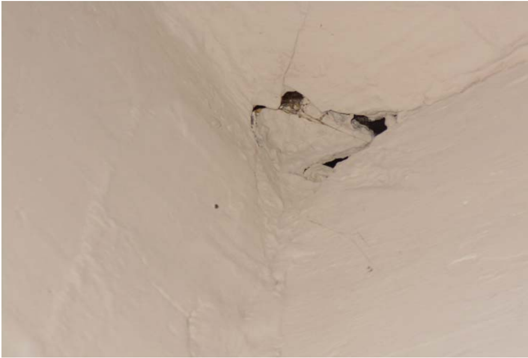
Photo 80 - Hole in wall