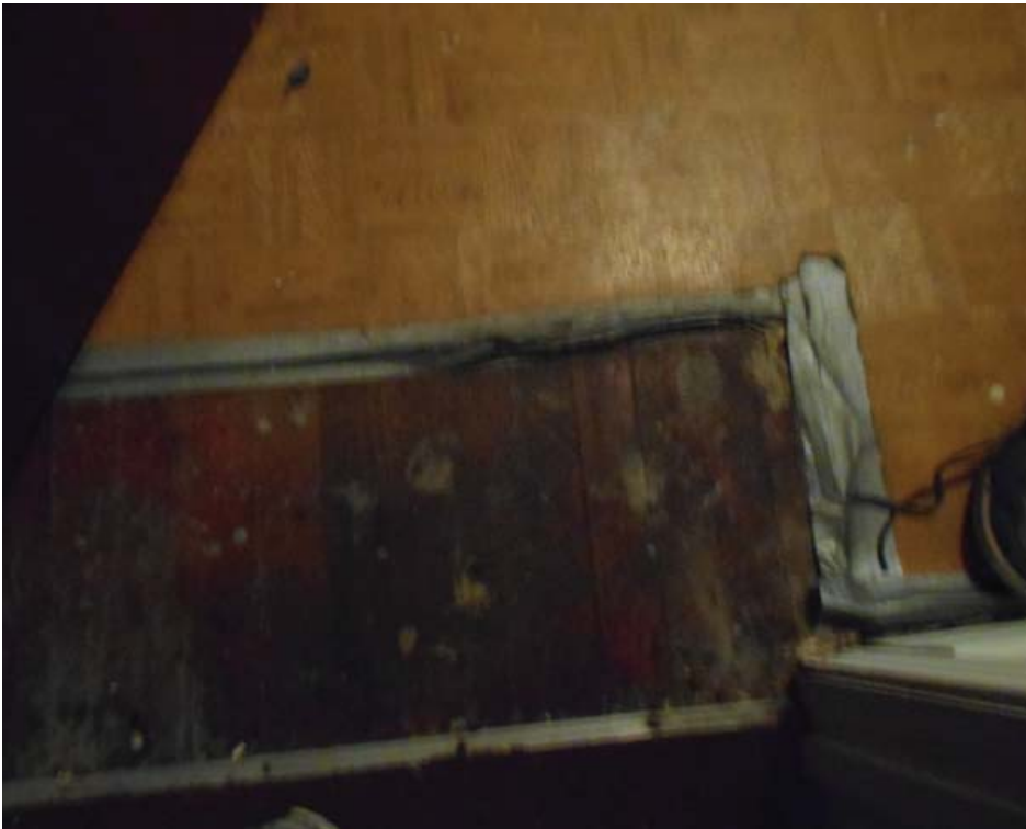
Photo 61 - Missing flooring with holes-held together with duct tape