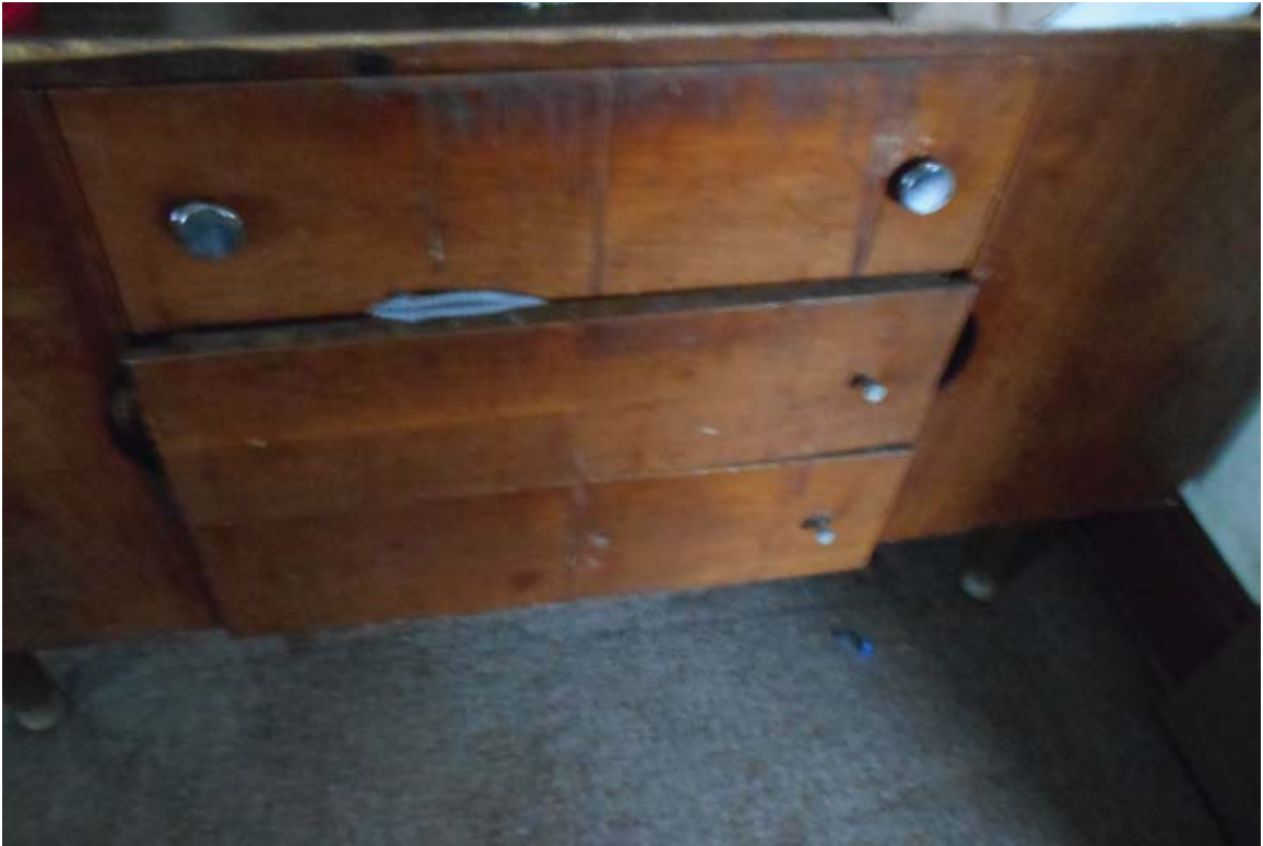
Photo 24 - Broken/stained furniture