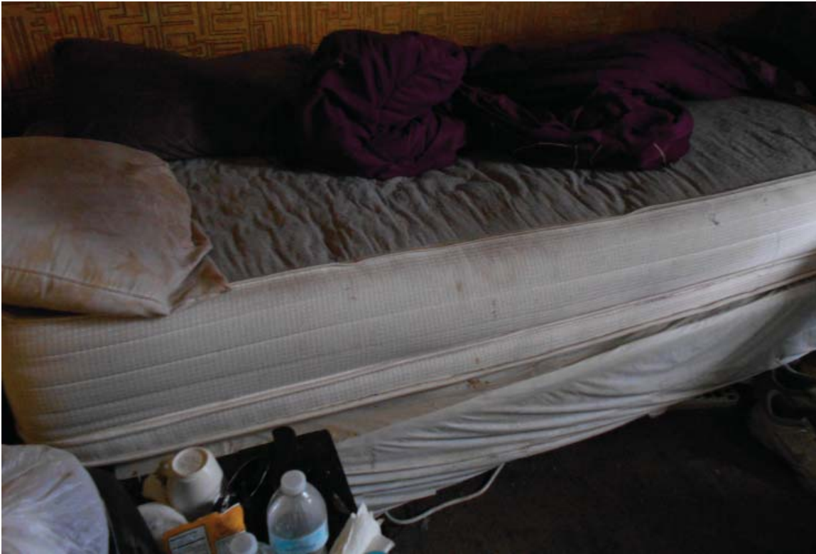
Photo 14 - Dirty/stained mattress/sheet-dirty/stained pillow without case