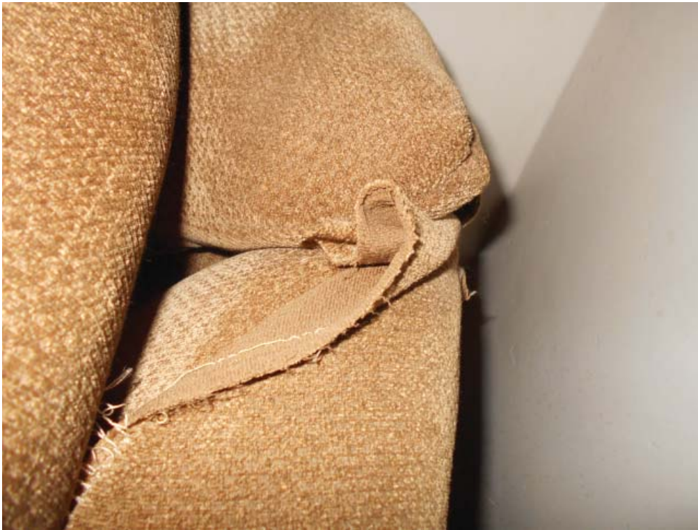
Photo 74 - Another photo of ripped furniture