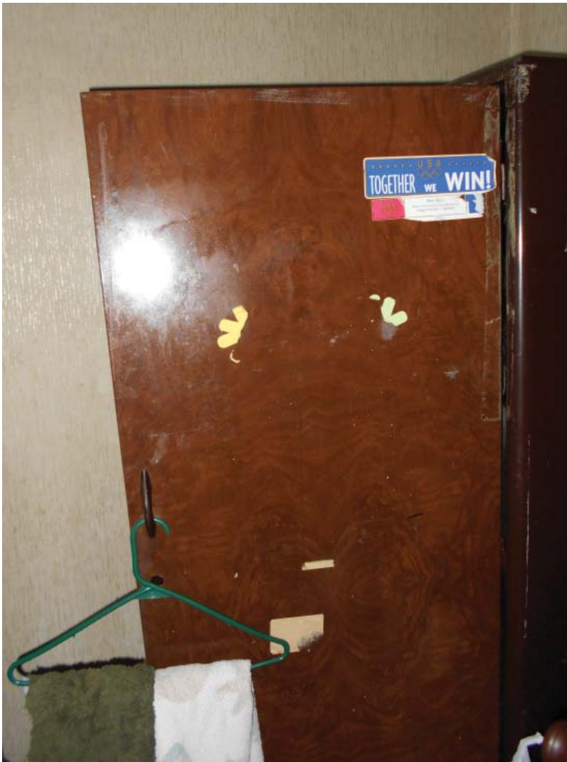
Photo 22 - Broken/marred furniture