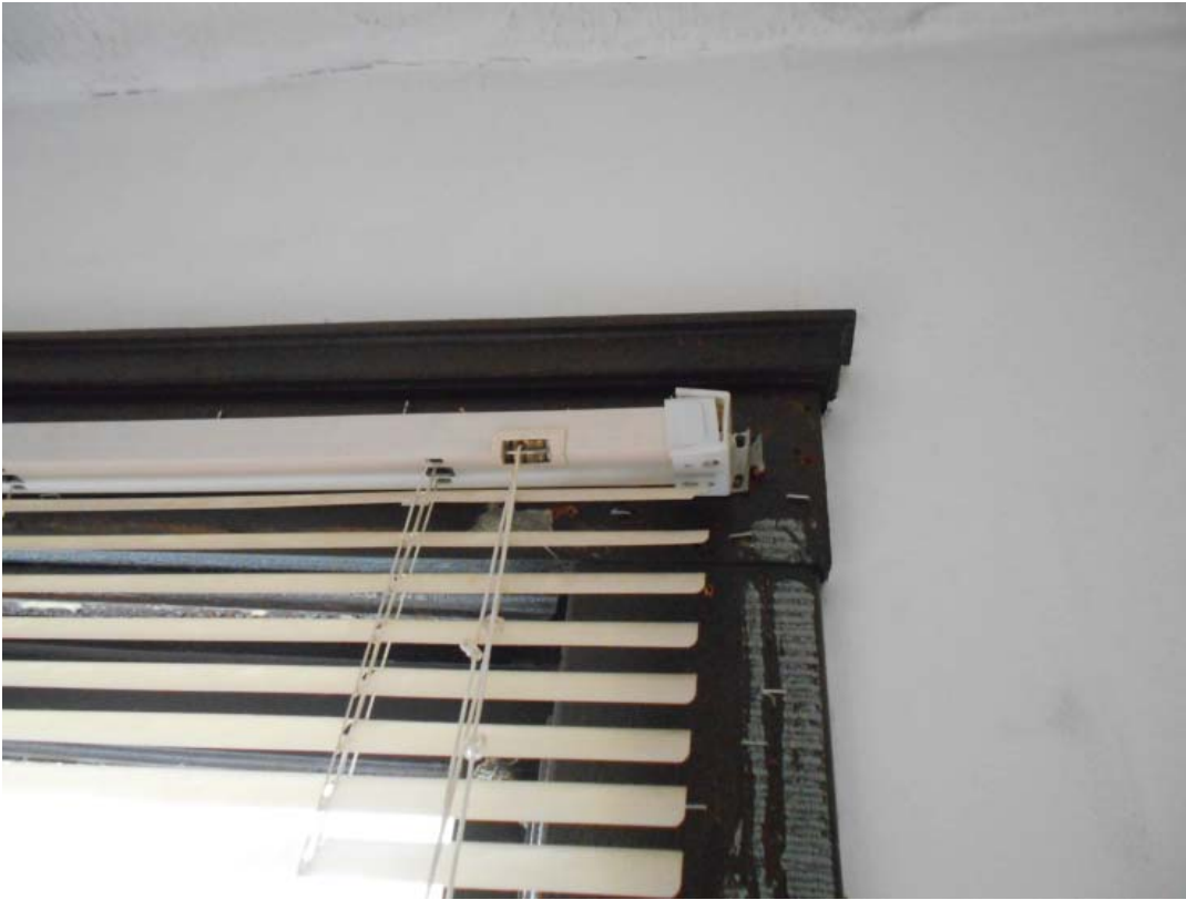
Photo 92 - Window frame covered with staples