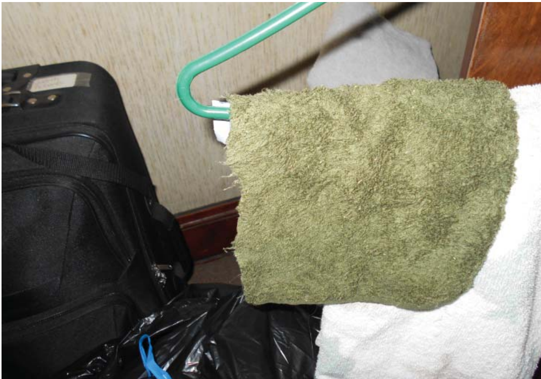
Photo 21 - Tattered washcloth