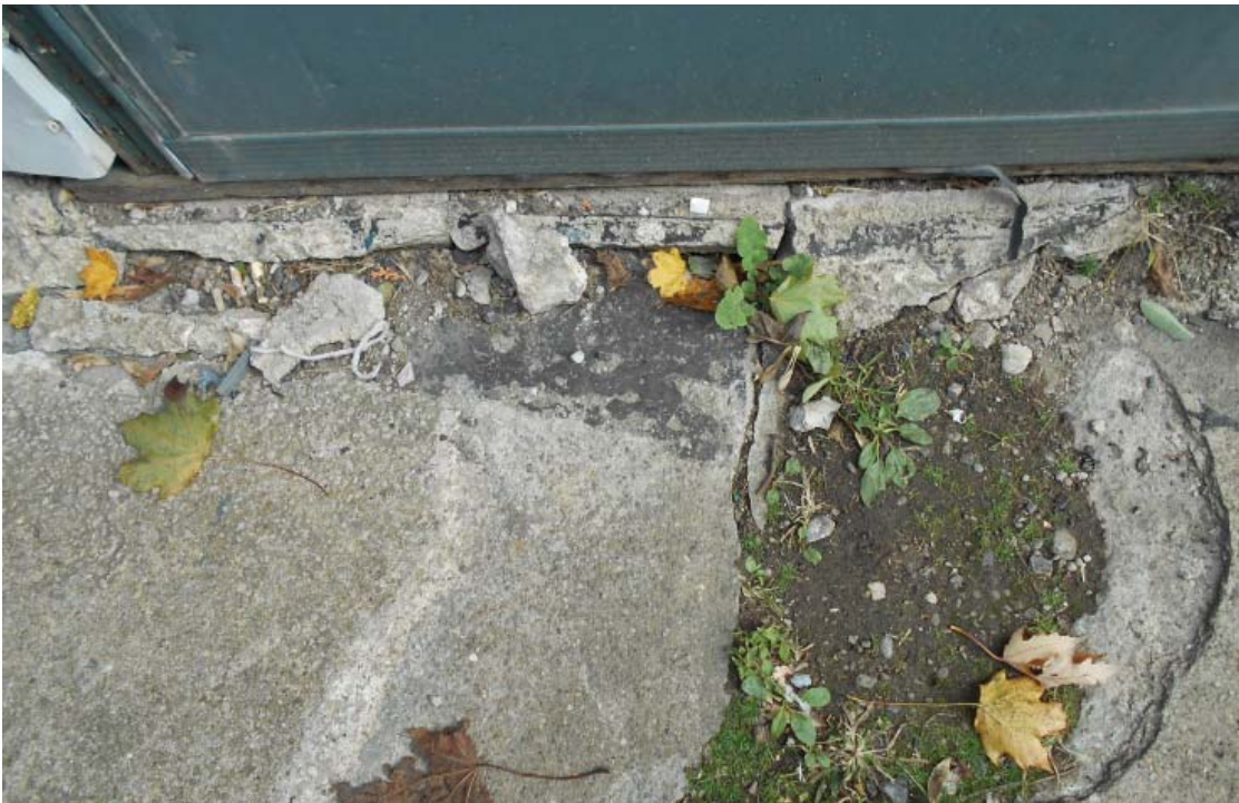
Photo 79 - Broken cement outside door-safety issue