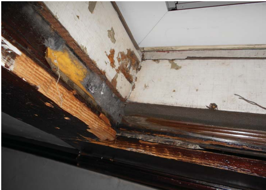
Photo 103 - Window frame and sill-broken/filthy/unknown particles