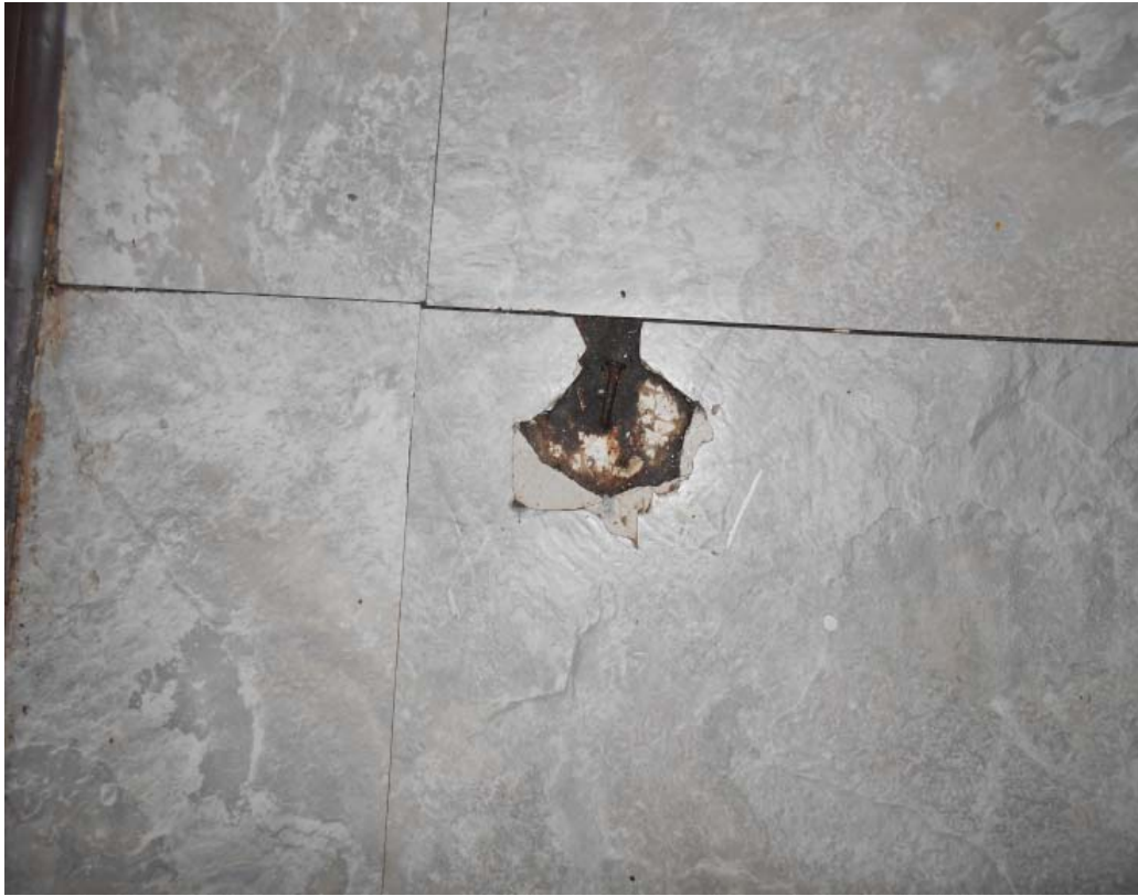
Photo 88 - Broken tile with hardware in the bottom