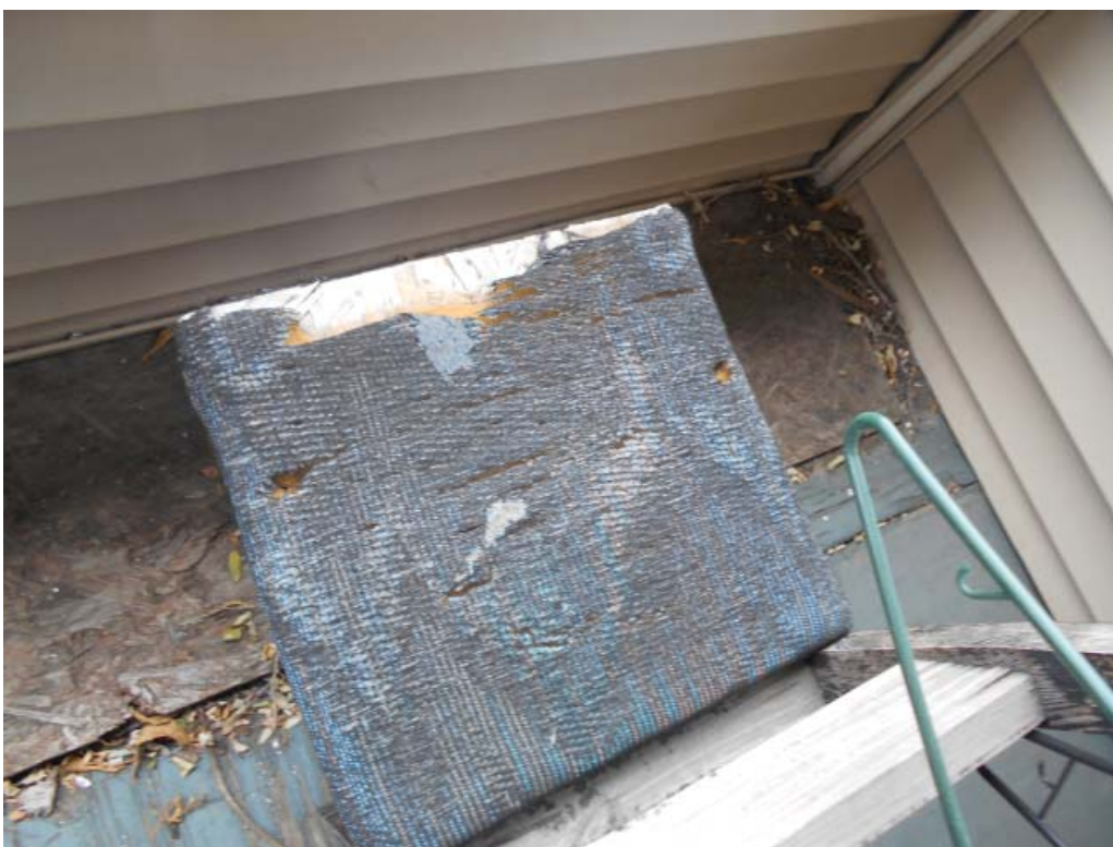
Photo 33 - Chair on second floor porch that is broken and unsafe