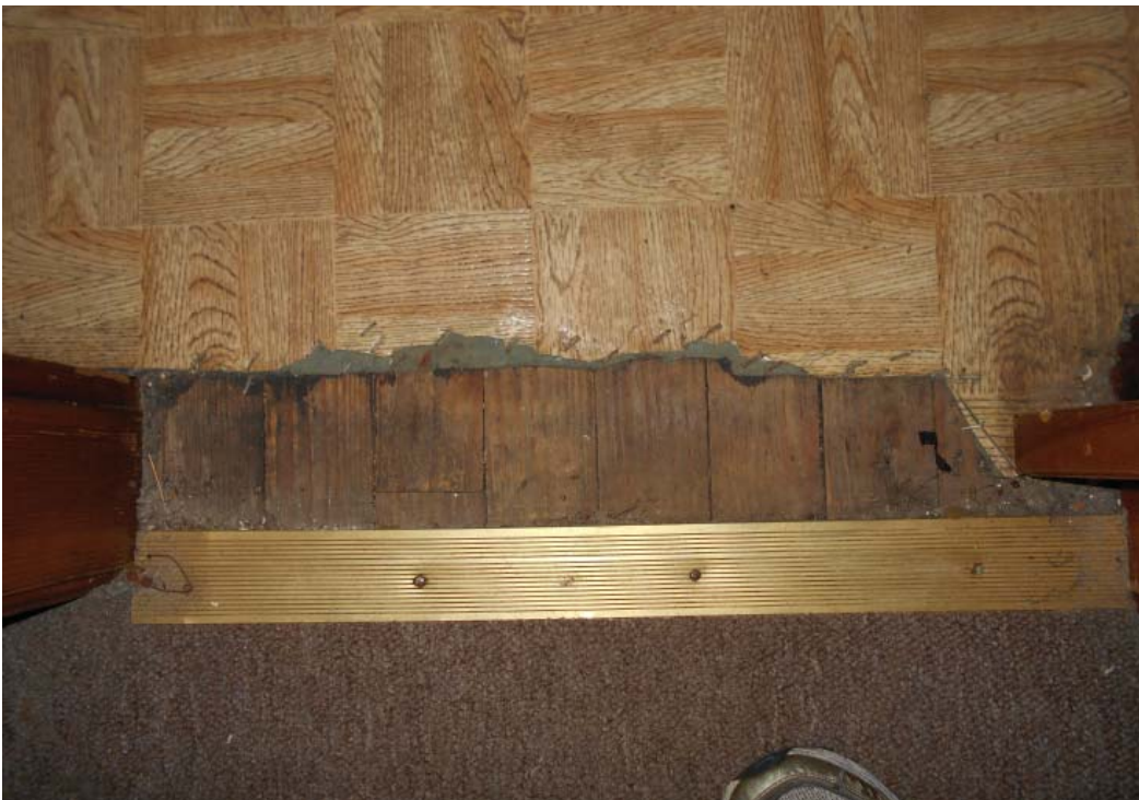
Photo 19 - Broken flooring-missing tile-dirty