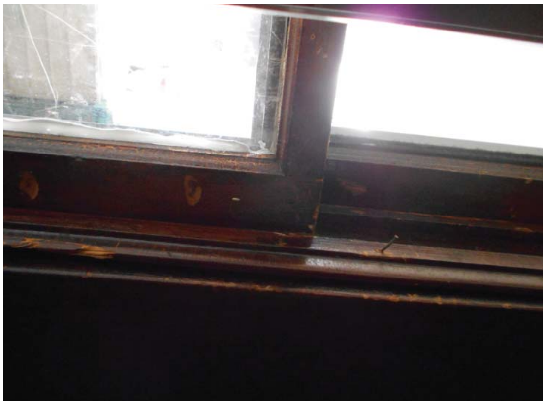
Photo 7 - Window frame splintered with pieces of wood missing and exposed nail