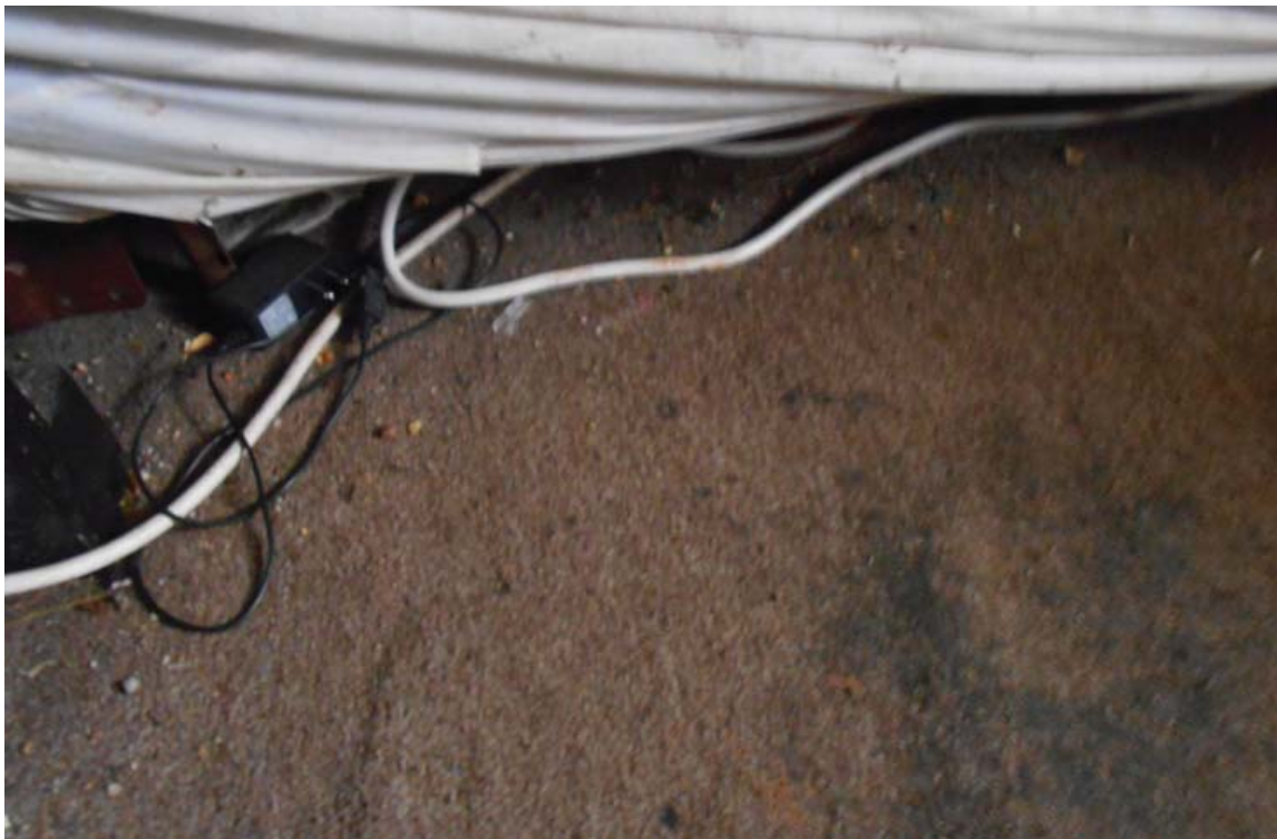
Photo 15 - Dirty/stained carpet