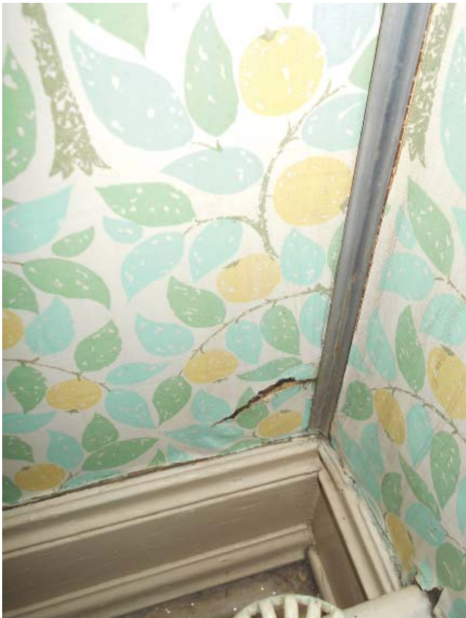
Photo 20 - Hole in wall-dirt