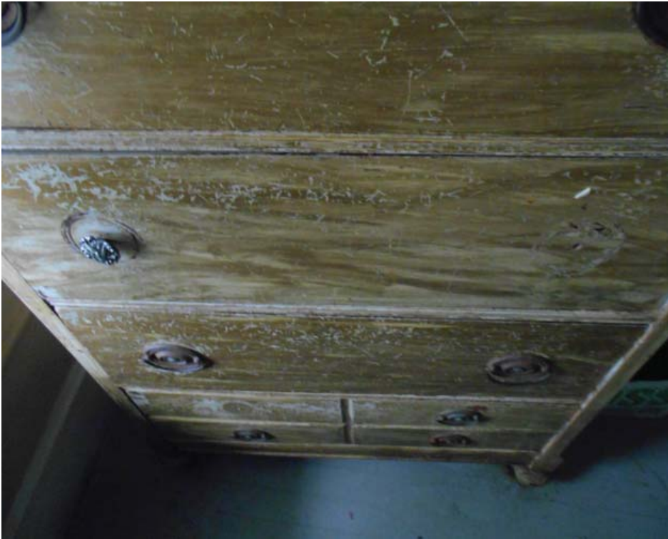
Photo 60 - Broken/marred furniture