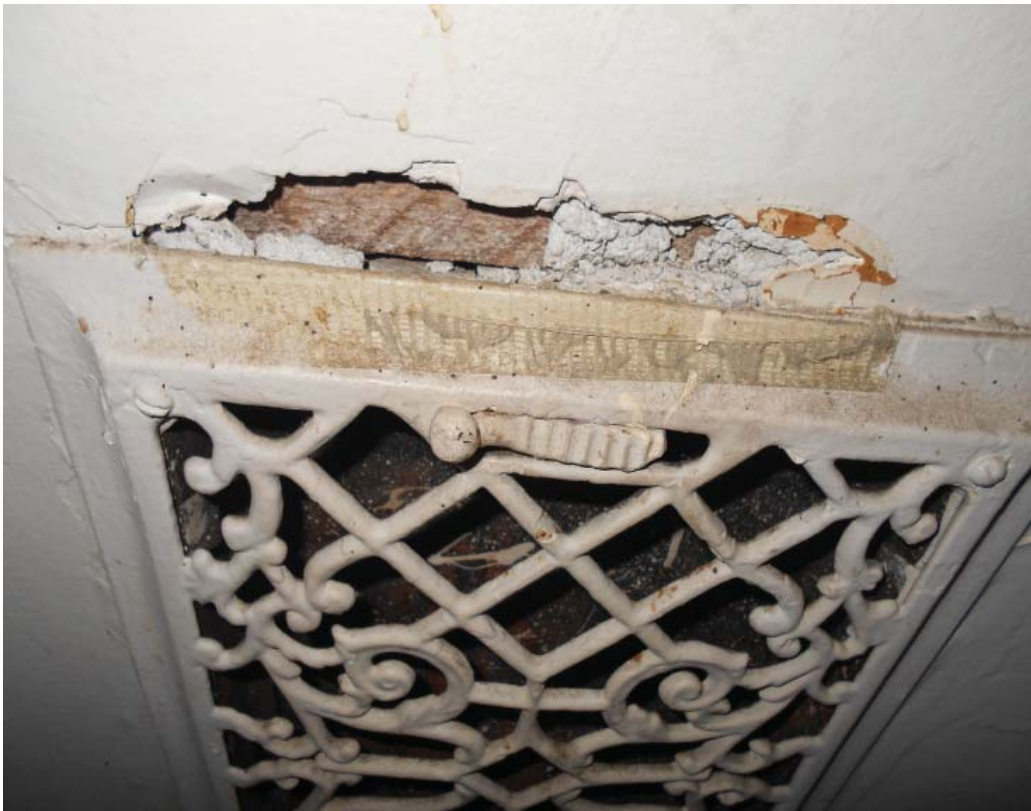
Photo 89 - Vent caked in dirty-hole in the top-cracked