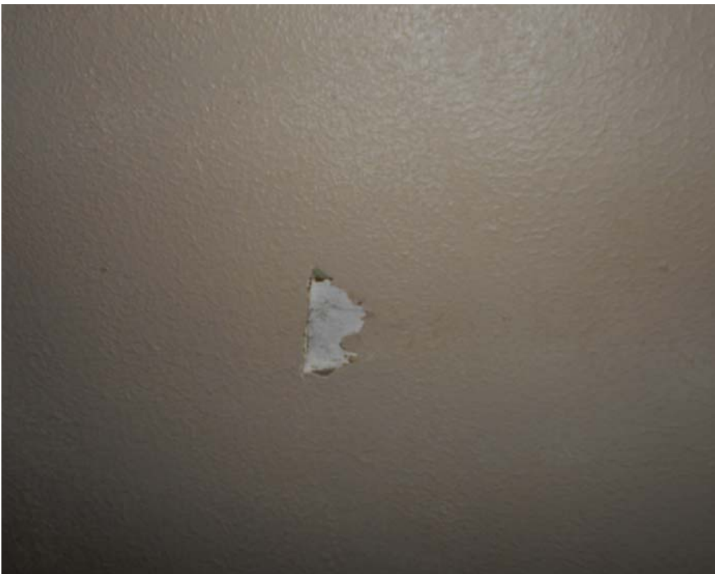
Photo 13 - Hole in wall