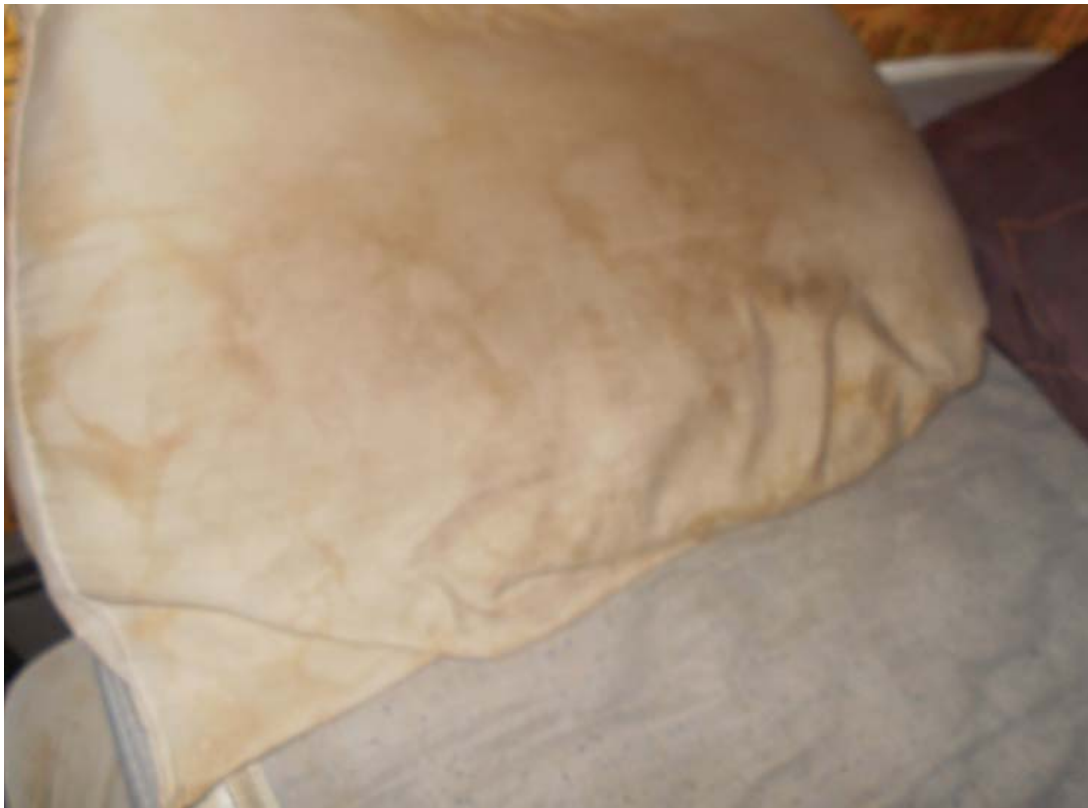
Photo 16 - Stained pillow