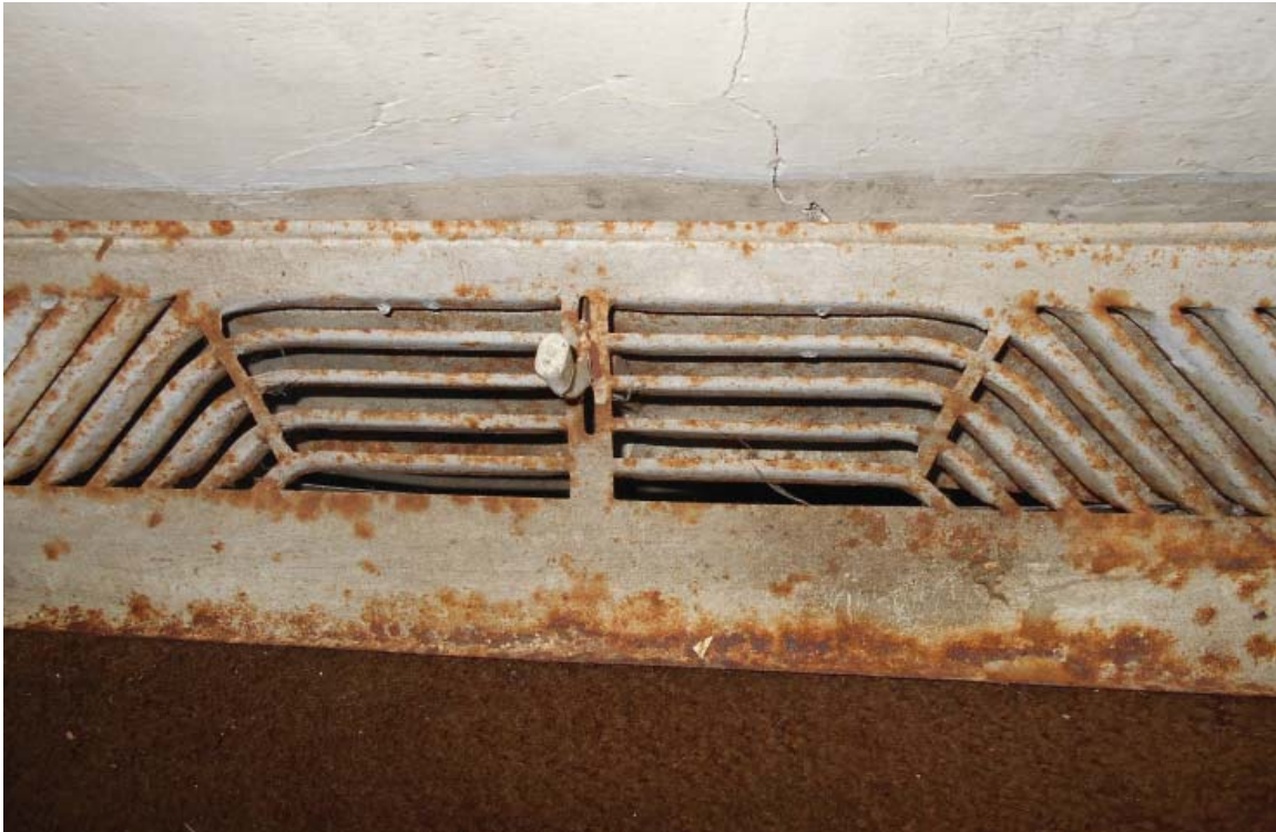
Photo 72 - Vent in room that is rusted/cracked and covered in grey/black matter