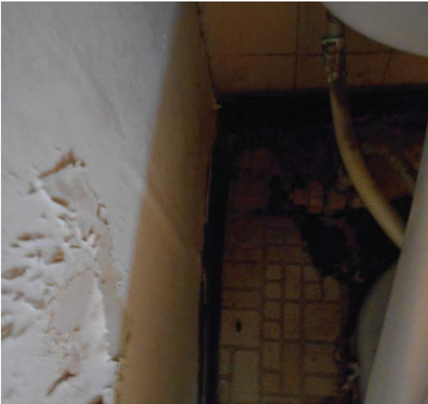
Photo 65 - Behind toilet the wall is covered in black unidentified matter-peeling wall