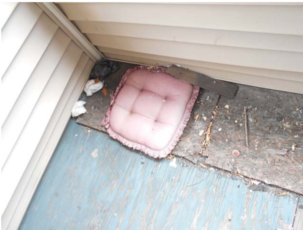
Photo 31 - Discarded chair cushion, trash, dirty, broken flooring on second floor porch