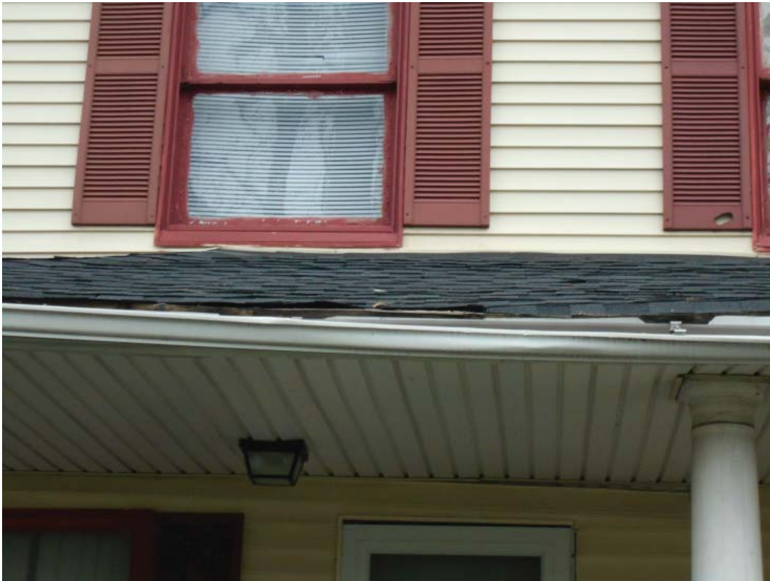
Photo 1 - Gutter separating from roof, roof shingles loose