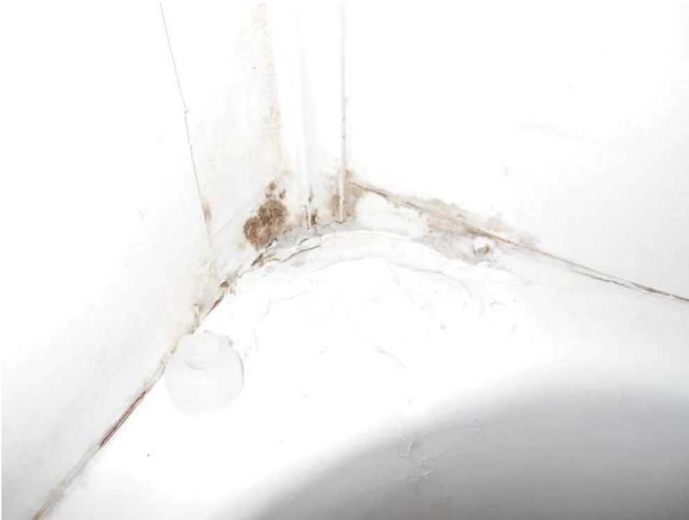
Photo 68 - Bathtub with unidentified black matter-cracked