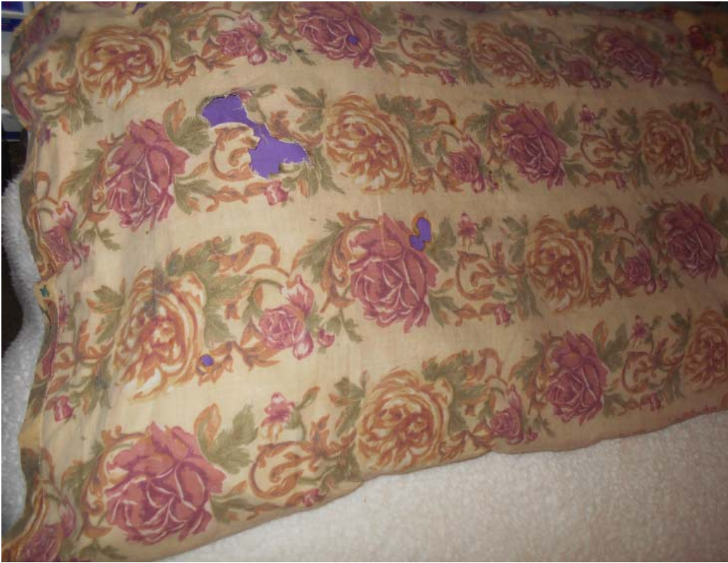
Photo 96- Ripped pillow