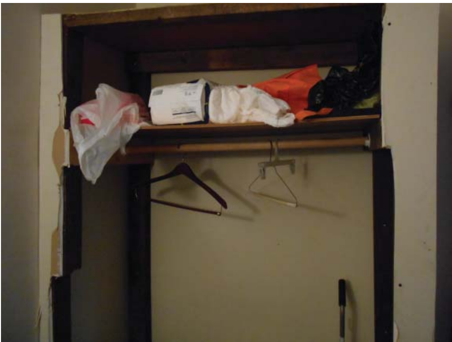
Photo 51 - Makeshift broken closet with two hangers