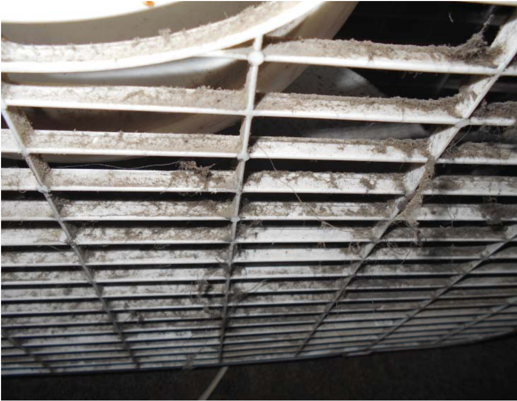
Photo 90- Fan caked in dust being used in an individual's room