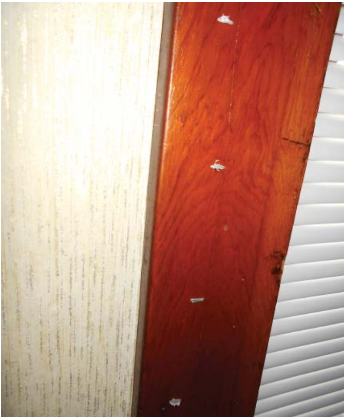
Photo 27 - Staples on window frame