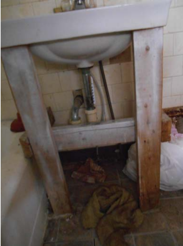
Photo 42 - Bathroom sink held up by 2x4s- trash bag on floor- rags on the floor- stains/dirt/filth