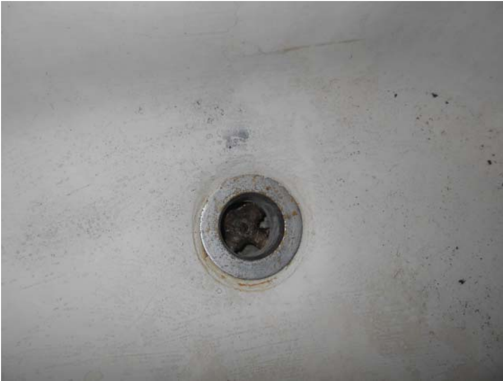
Photo 70 - Bathtub drain-caked matter-marred bathtub