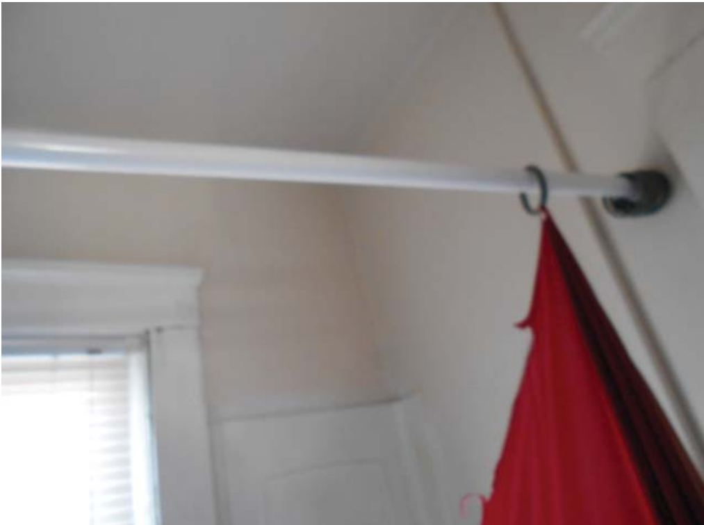
Photo 82 - Shower curtain held up by one hook