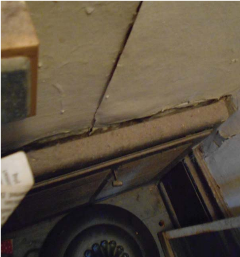
Photo 50 - Dirty-unknown particles-vent separating from wall