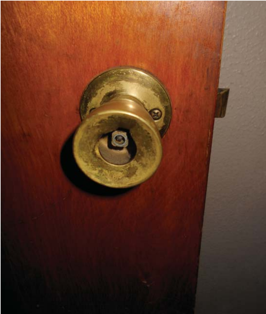
Photo 48 - Broken door knob