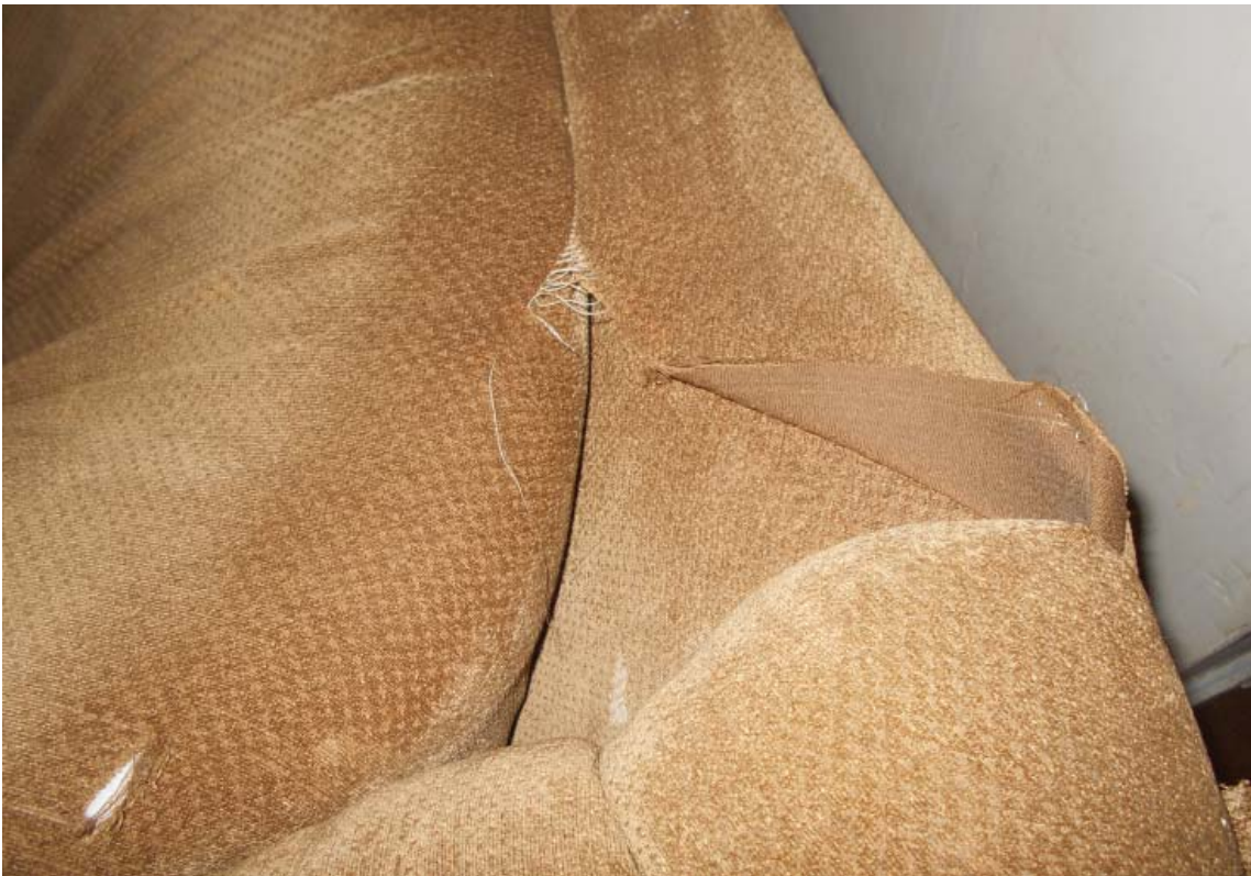
Photo 73 - Ripped furniture in common room