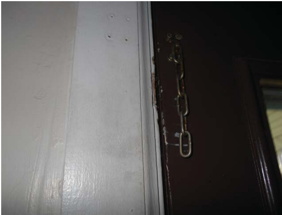
Photo 56 - Chair lock missing the lock device