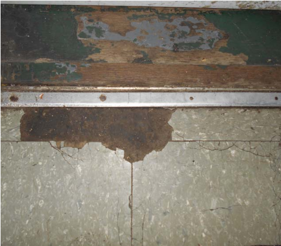
Photo 12 - Floor tile missing-wood missing-cracked- dirty