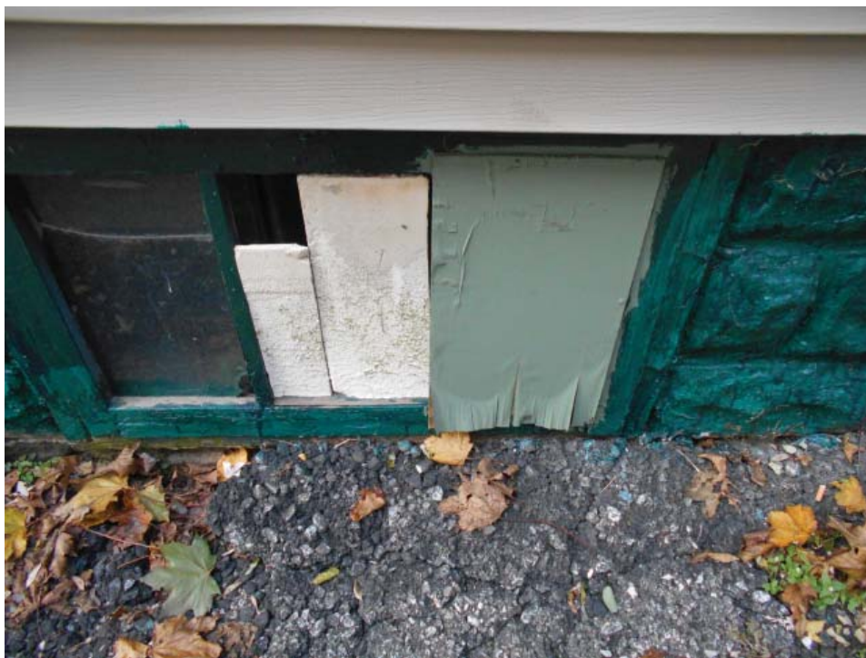
Photo 53 - Window missing glass-makeshift boarded up