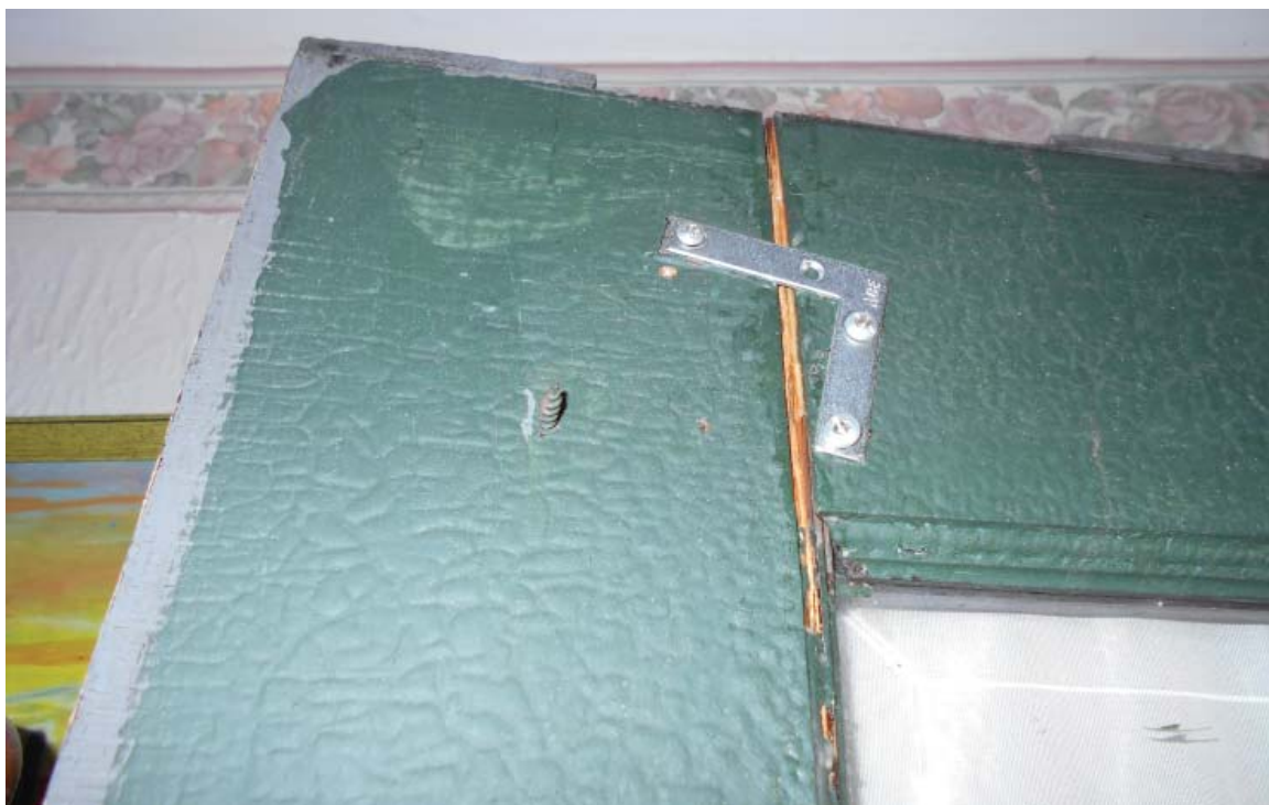
Photo 5 - Another photo of broken front door with another clamp and exposed screw