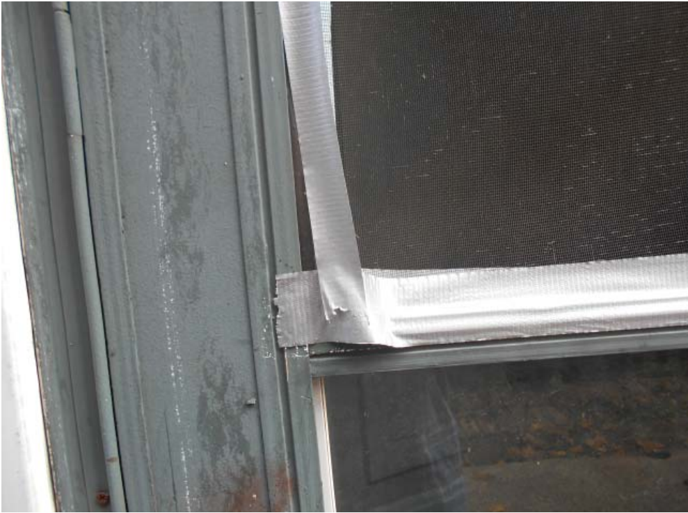
Photo 78 - Duct tape on screen