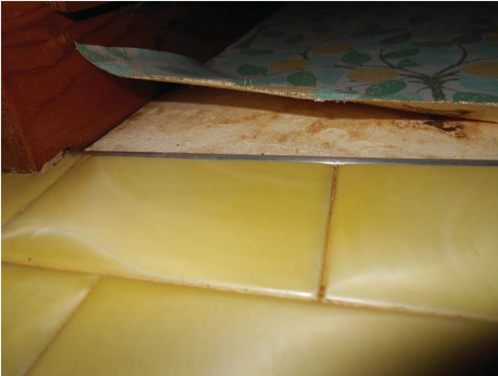
Photo 36 - Wallpaper unattached to wall