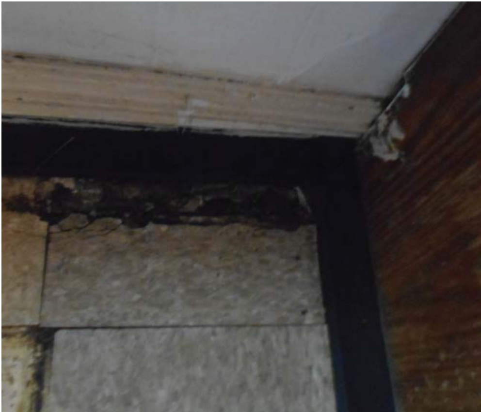
Photo 10 - Broken/ missing tile-dirty/ unknown black matter