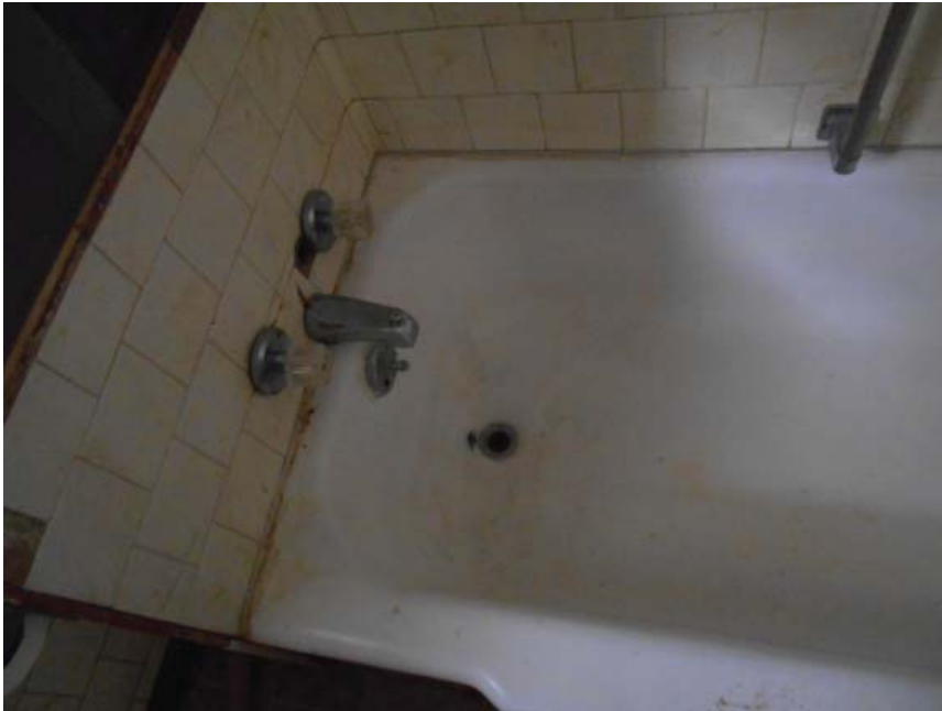
Photo 44 - Stained bathtub with missing tile-black/orange/brown stains-presence of unidentified black matter