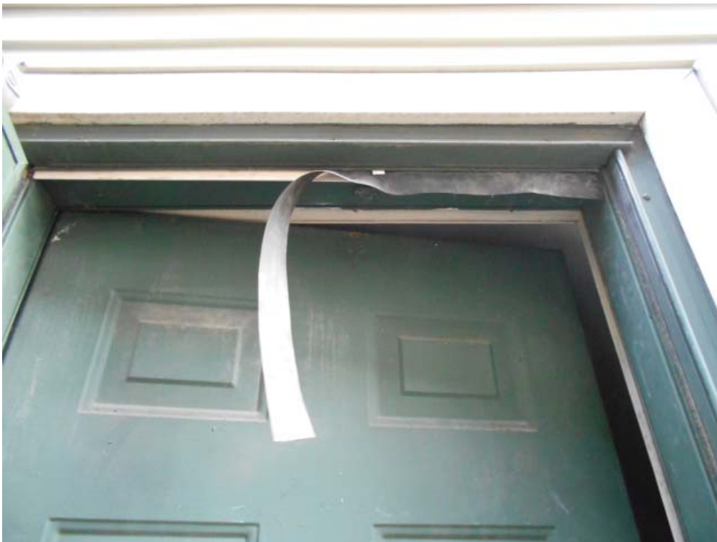
Photo 77- Duct tape hanging from door