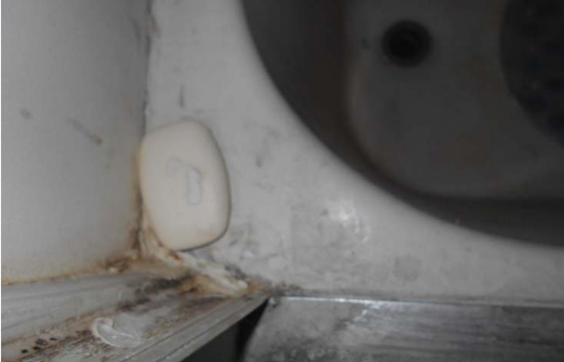
Photo 67 - Bathtub-black/brown/yellow unidentified matter