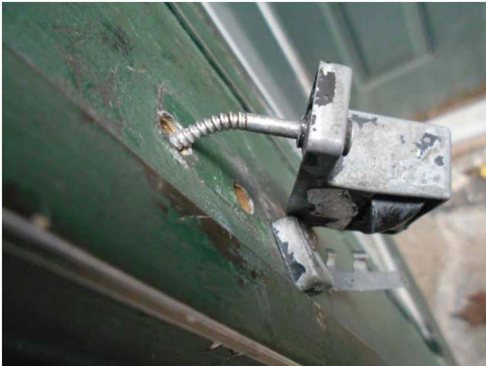
Photo 75 - Broken door-