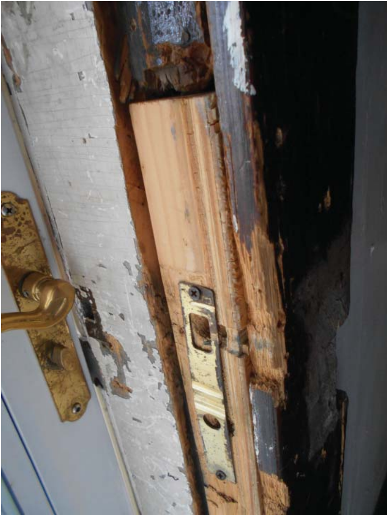
Photo 104- Broken door