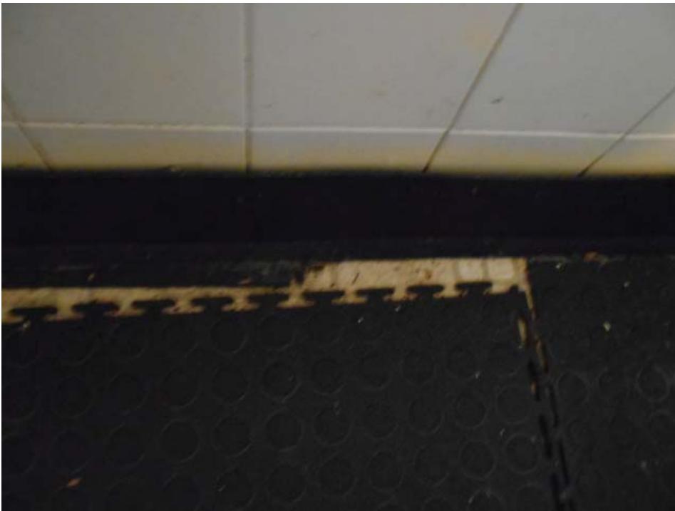
Photo 63 - Bathroom flooring-ripped-torn