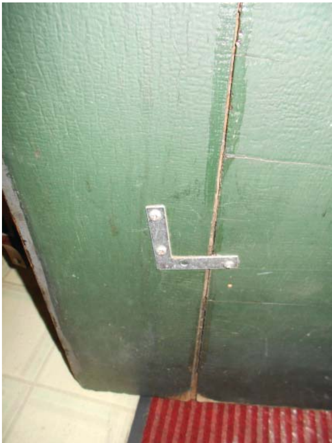
Photo 4 - Front door broken-held together with clamp