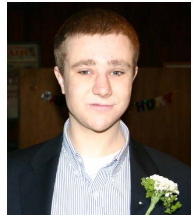
CT teenager injured from being restrained and secluded.