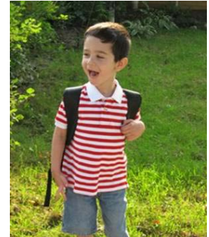
Wisconsin boy, age 3, tied up and traumatized