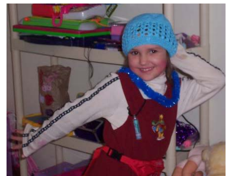
Wisconsin girl, age 7, killed when restrained and secluded