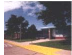
Colorado school where children were secluded

Even in today's tumultuous world, all families should be able to expect that their children are safe in their neighborhood schools -- not tied to desks, locked in storage closets, shoved in large dark boxes, or pinned down by adults two and three times their size. However, P&A programs across the country have reported the use of these shocking and dangerous practices.