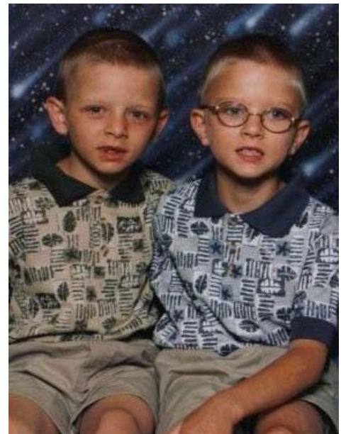
Connecticut children retraumatized when secluded

or area from which the person is physically prevented from leaving, “time-out” is a “behavior management technique that is part of an approved treatment program and may involve the separation of the individual from the group, in a non-locked setting, for the purpose of calming.” 42 U.S.C. § 290ii(d)(4) and 290jj(d)(5).