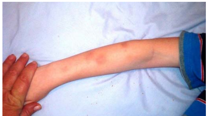
Bruising from restraint in Tennessee