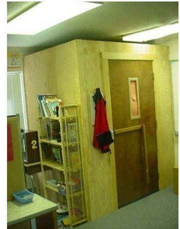
Classroom seclusion room, Kansas