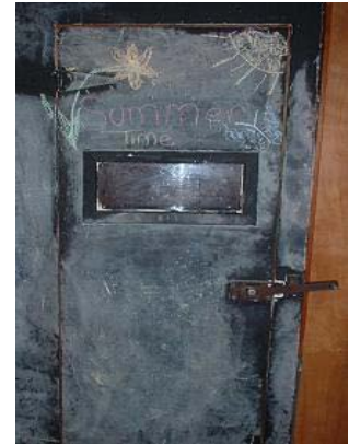
Tennessee seclusion door

In March 2007, the Tennessee P&A received a report from a parent in a Sumner County elementary school that their child was being put in a 4' by 3 ½' plywood box (on right). The P&A investigated and got the Sumner County School District to remove boxes throughout the school district (12 schools total). Since then, the school district has followed the P&A's recommendations to create appropriate calming areas and has allowed the P&A to continue to monitor the schools.